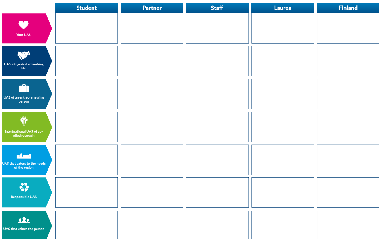
Figure 3. Laurea’s strategy themes and dimensions of internationality

To complete the frameworks, we handed out green, yellow and red Post-it notes to the respondents. The different colours indicated good and functioning practices, development areas, and potential omissions.