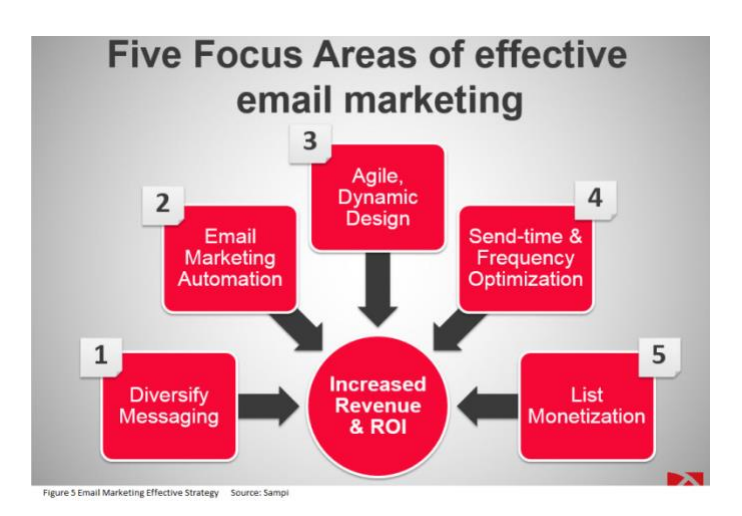
FIGURE 4. FIVE FOCUS AREAS OF EFECTIVE EMAIL MARKETING (Sampi website 25 October 2017)

This tip is about questing and identifying the primary goals, what should be received from implementing this strategy. It is very significant to determine the area of improvement in a digital marketing plan. Some questions should be analysed and answered by a company: who is a company writing to, what should be written there, are the emails provide all the useful information, how is it possible to improve these emails. These are the central questions to strengthen and develop. Everything should be done in the best way to increase the trust and profitability of a company. Figure 3 shows five focus areas of effective email marketing.