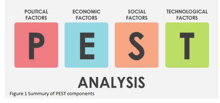
FIGURE 1. PEST (NET MBA 2008)

Political issue is about labour laws, tax policies and other political factors play an important role in the trade regulations. Each country has it is own policies with special regulations. In EU most countries have similar regulations with each other, speaking about other countries such as Russia; it can be a problem to have a partnership with a country which has totally different policies than in EU. So, government has a very strong impact on trade restriction which can cause some barriers. All of these factors can move or stop a business development of particular company. Another significant factor is economic which consists of interest and inflation rates, economic growth and others. Import and export connected to the exchange rate of a country which can change from an inside and outside political situation. Social factor can be defined as the most valuable factor in PEST marketing strategy because this factor analyzes demographical, cultural aspects. Day to day marketers analyze a new area of potential business with possible customer needs in the future. Technological factor in a fast-growing world plays a huge role in business environment. Day to day technological progress in marketing shows the ability to combine people's wishes with technical and digital side of data. Mostly everybody uses phones, laptops, computers and other devices which help them to be updated every day.