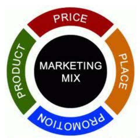
Figure 2 The basic concept of 4p model

FIGURE 2. The basic concept of 4p model (BUSINESS FUTURES BLOG, 2013)