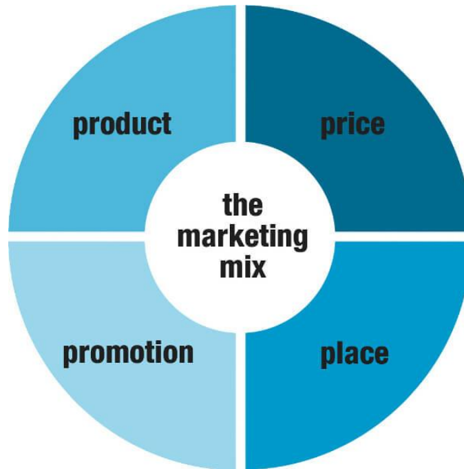
Figure 2. The Marketing Mix (Hotel Minder 2018.)

The thesis topic is highly marketing based, and the marketing mix model of E. Jerome McCarthy is therefore a very good basic theoretical bedrock. Furthermore, it includes “place” as one of its components, therefore including the digital sales channels as well (that’s an essential part of the thesis topic as well).