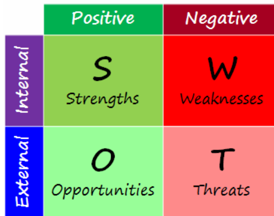
Figure 3. The SWOT matrix (McMaster University 2018.)

Considering my thesis topic and its relation to the SWOT reality, this is something that the independent artist striving to market their music must conduct on their own work and brand. In discussions with my thesis planning course classmates, they noted a good point that conducting research on the different tools that digital marketing offers, one has to also consider the type of music and artist brand at hand, since consumers from different genres of music might be suitable to different kinds of marketing channels to approach from. Therefore, finding out one's own genre's and brand's strengths, opportunities, weaknesses and threats can be helpful in channelling one's marketing funds to the right places to gain maximum reach and effect.