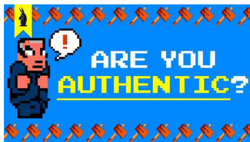
Figure 4. Heideggerian Authenticity (YouTube 2014.)

Based on the notion of Heidegger M. (1978) that existential authenticity is an overarching framework for a music consumer's identity. This psychological / marketing theory helps me to analyse the differences between genres and artists/bands' when it comes to different sales and marketing channels' performance with different music consumer groups.