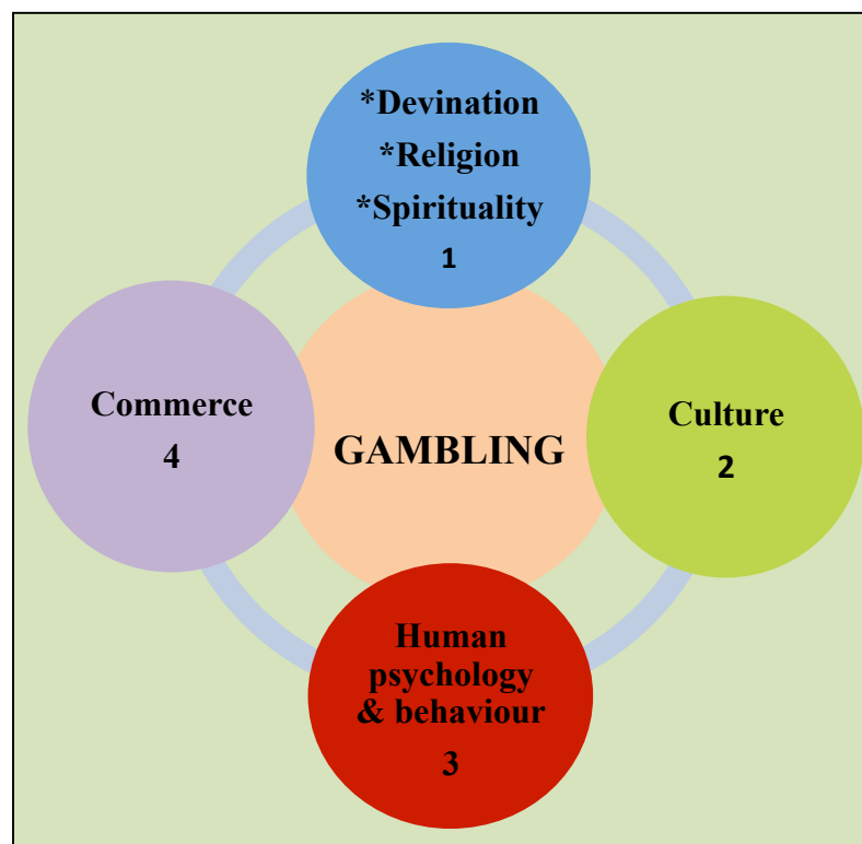
FIGURE 1: My understanding on development of gambling in the world.

Human beings are the products of their own best cultures, religions, numerous rituals and ceremonies, which they have been practicing for centuries. Today also those people, who still want to try their luck, have fun or earn much money, worship gods or follow a certain cultural traits before gambling ventures and are found struggling in the casinos and gambling venues around the globe. Some people still carry the superstitions about what are the right attempts to gambling, for instance, presuming only one lucky table for play, special clothes and previous night's dream.