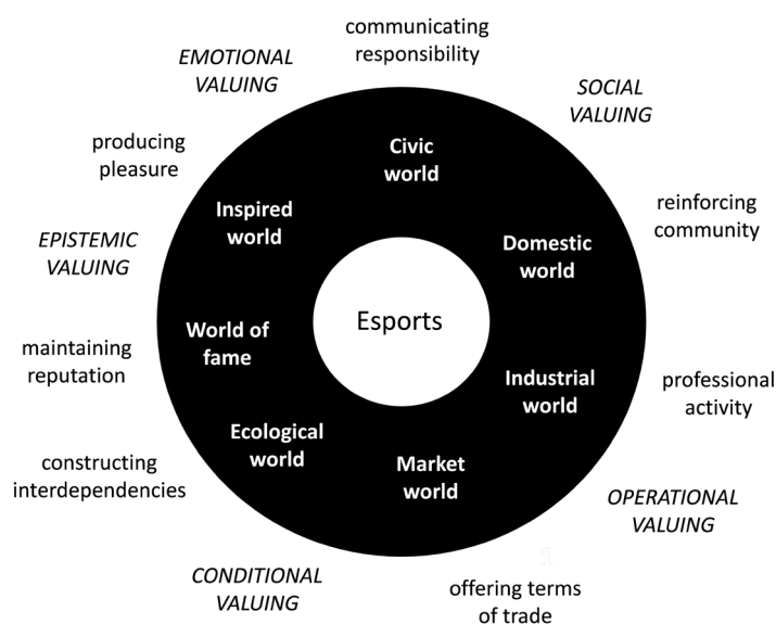
Figure 3. The worlds of worth and means of valuing in the e-sports ecosystem.

In accordance with the ideas of Boltanski & Thévenot (2006) and Sheth et al. (1991), Figure 3 is a concise presentation of the potential manifestations of the worlds of worth in the e-sports ecosystem and the various means of valuing. E-sports operators constitute a distinct ecosystem, the success of which depends,