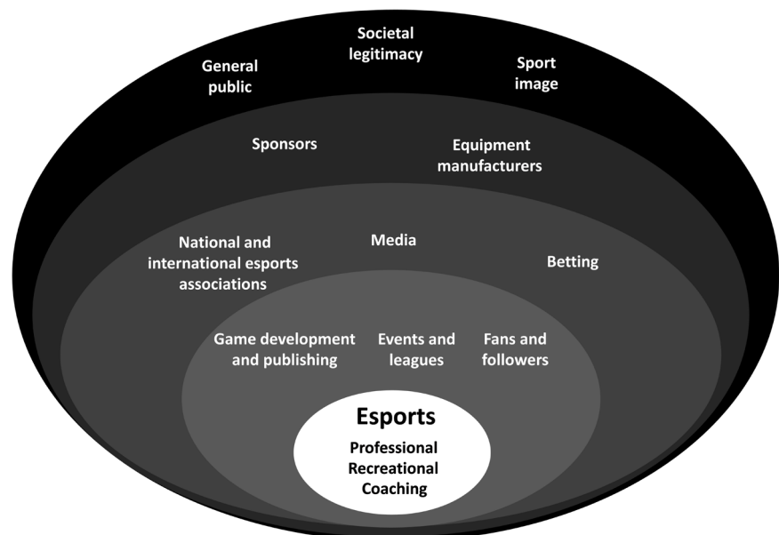
Figure 1. The multi-level e-sports ecosystem.

The business potential of the e-sports ecosystem is generated by the interdependencies of various factors. At the core of e-sports lies either professional or recreational competitive gaming. Succeeding in e-sports tournaments and leagues requires careful preparation. Matches that last for hours, the minimisation of disadvantages due to different time zones, and the pressure arising from high cash prize sums and the fans' expectations necessitate psychological and physical coaching of the players. E-sports content with media interest comes from professionally constructed events, in which the e-athletes are capable of performances that speak to the audience. At the top of the game, the cutting edge is narrow, but its sharpness is proportional to the wideness of the base of recreational gamers. Large numbers of recreational gamers attract game developers and publishers. Securing the generation of players requires investments