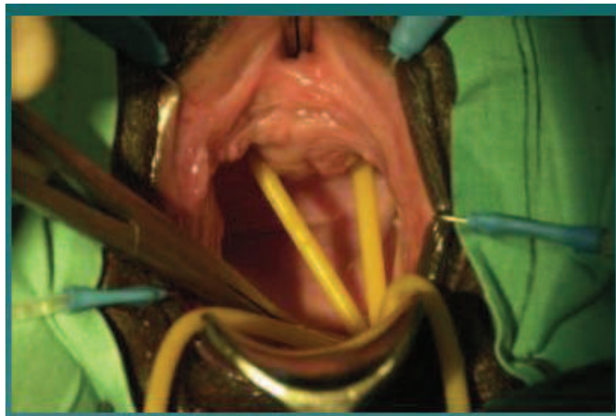
Figure 2 Simple fistula demonstrated by opening of the labia. (C-H Rochat, 2003.)

Fistula can exist in two forms simple and complex fistula. Simple fistula is easily identified, it is easily treated and the vaginal tract is not significantly impaired during surgery. Figure 2 illustrates simple fistula exposing the perianal region which is below the pelvic diaphragm and the patient is operated on using simple tools (Firous Daneshgari M.D).