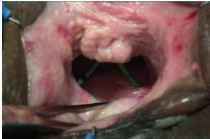
Figure 3 complex vesico-vaginal fistula repair. (C-H Rochat, 2003.)

Complex Vesicovaginal fistula involves the vaginal or abdominal approach depending on the location and therapy. The vaginal approach is commonly used as it allows high cure rate, short recovery and it is less complicated. Figure 3 illustrates complex vesico-vaginal fistula repair using traditional treatment. The vaginal approach reduces bleeding and infections after the whole procedure.