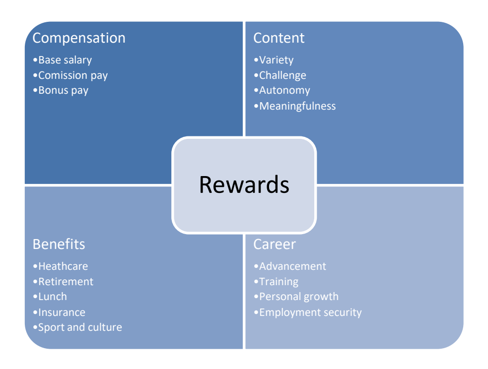
Table 2 Reward system (Korpinen 2019)

Companies want to keep their employees motivated and reward them for good work, as the employees are the most important asset the company has (Sperling 2015). Reward is not always a money compensation; reward can also include other kinds of advantages the employees might get from doing a good work. These advantages can be bonus pays, variety and challenge in content, health and lunch benefits and possibility to grow in the company. (Korpinen 2019.) Common rewards offered to the employees can be seen in Table 1.