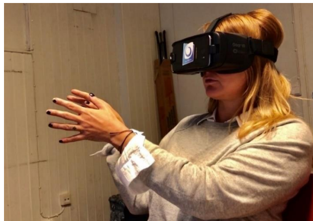
Figure 2. A participant learning how to control the game.

First the VR gear and the idea of the session were explained to the participant. The participant put the VR gear on and learned how to control the game and the gear (Figure 1). The scenario was initiated by the participants when they felt ready. The gaming sessions took 10-28 minutes.