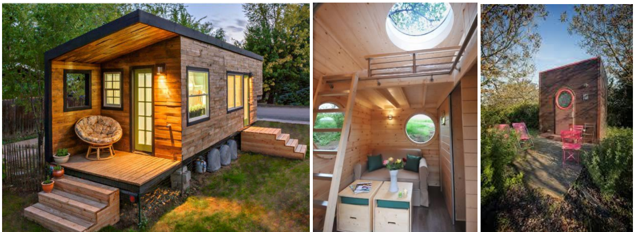
Figure 5: Types of the Tiny House (ImmobilienScout24, 2017) (AbracadaRoom, 2019)

Tiny houses are mini-houses that often feature impressive, functional equipment on an area of around 30-40 square meters. The demand for tiny houses is currently still growing. Nevertheless, this trend, especially for tourism, is interesting in rural regions, where a new form of accommodation could be created. The occupancy number depends on the equipment of the tiny house. The ideas of what the future tiny houses in the Archipelago Sea could look like are illustrated in Figure 5. Tiny houses could be accommodating guests all year round.