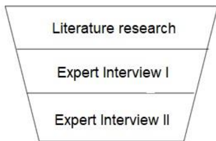
Figure 4: Sequence of data collection

Figure 4 illustrates the data collection flow used in this Bachelor Thesis. Data collection process forms a so-called funnel, which begins with a lot of collected data which is getting dramatically reduced at the end of work.