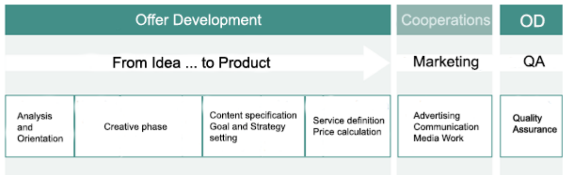
Figure 2: Visual representation of a New Product Development process

Under the term «Product Development» understood all activities meant to solve problems leading to a marketable product. Product development process begins with the idea and leads through various steps to the product, which can then be marketed and tested qualitatively (Natur-Kultur-Tourismus, 2011, p. 26). The various steps that were used in this Bachelor thesis are illustrated in Figure 2 and explained in the following sections.