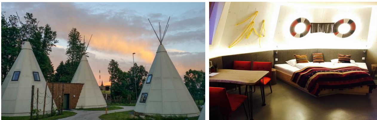
Figure 7: Modern Tipis

The modern tipi has the same shape as the original tipi, but it is a stable construction made of wood. With a modern tipi, the number of occupancy depends on the equipment. The modern tipis can be built on one or two floors. In contrast to the original tipis, there is a sanitary facility in the modern tipis. The way how modern tipis might look like is shown in the figure 7. The modern tipis are in use all year round.