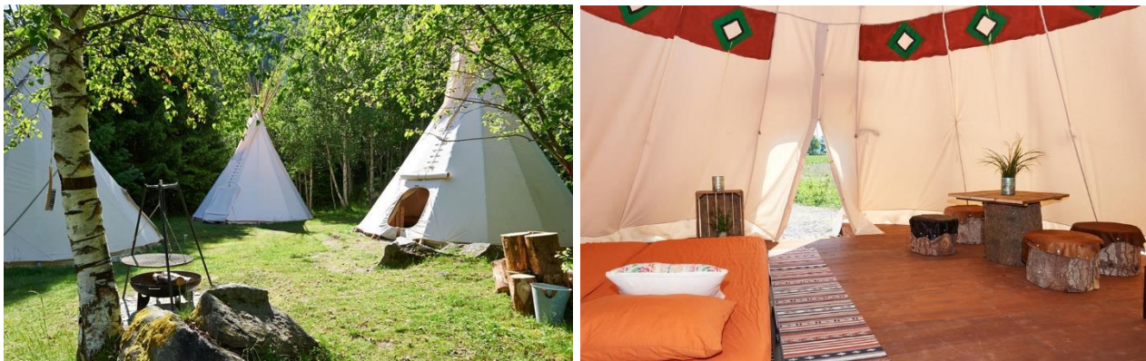
Figure 6: Original Tipis (TCS, 2019)

option for the guest and therefore does not offer a luxurious comfort experience. Figure 6 shows how the original tipis as an accommodation offer could look like in the future. The original tipis will only be used in the summer season.