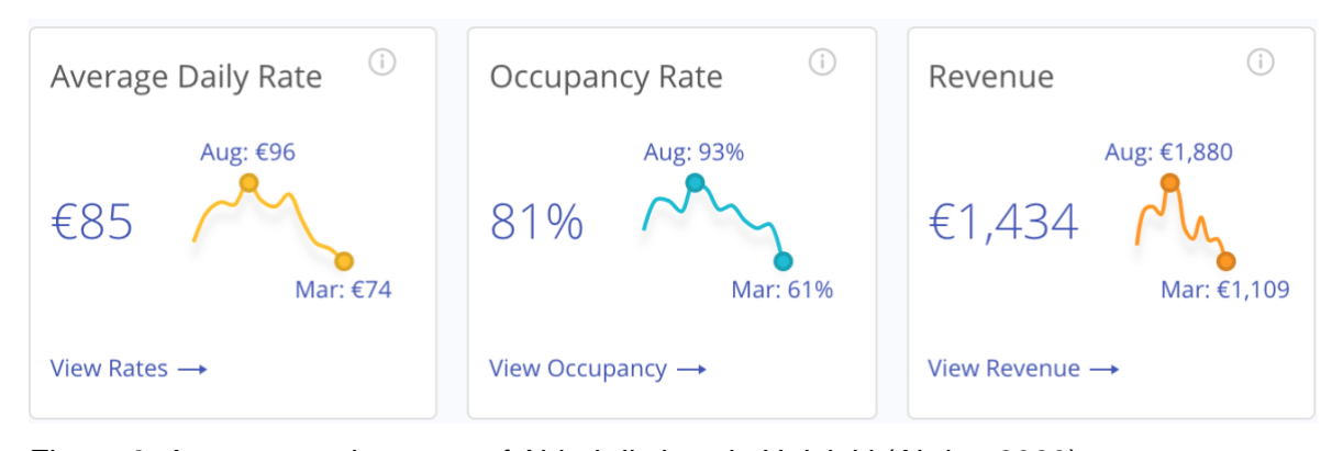
Figure 3. Average market rates of Airbnb listings in Helsinki (Airdna 2020)