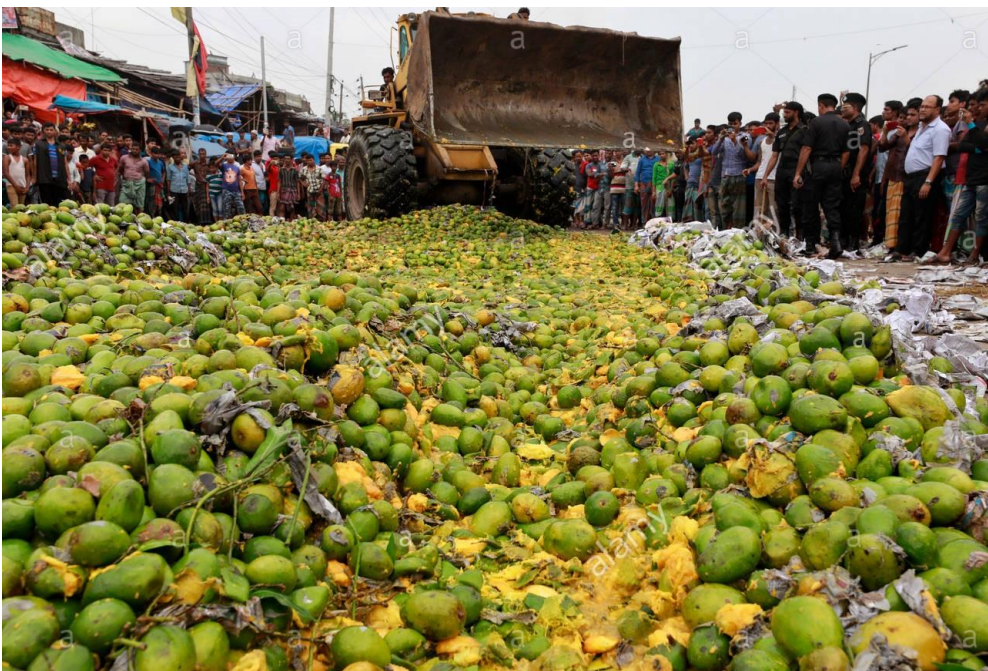
Figure 5: Rapid action battalion (RAB) mobile court seized around 40 tons mango.

In Bangladesh recently, the cabinet of the government of the people's republic of Bangladesh passed the 2014 formalin control act 2014, which provides for a maximum penalty of life time imprisonment or fine of 20,00000 taka or both, depends of the intensity of the crime to prevent food adulteration. According to the law, traders must be licensed to import, stock, sell, and market formalin. The law provides for a maximum term of imprisonment of 7 years or a fine of 5,00000 taka or both, if the terms of a formalin license are violated and formalin is illegally stored in houses, offices, businesses, or vehicles. The law also provides for a maximum of ten years in prison or a fine of 20,00000 for possession of formalin production equipment. The police can arrest any offender without the permission of the court if the case is done under the law (Bangladesh pure food act 2005) and authorities also using immediate action by introducing mobile court. Figure 5 showing artificially ripened mangoes are being destroyed at Jatrabari wholesale market at Dhaka in Bangladesh.