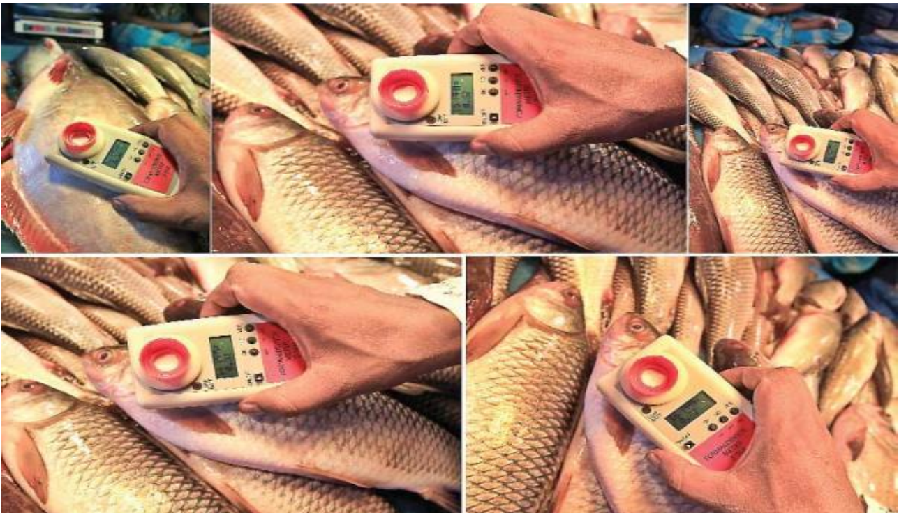
Figure 5: The figure shown the food security department of the state government of India has seized 12,000 kg of fish preserved in formalin ('Operation Sagar Rani'. 12,000 kg of fish seized. 2020).

Formaldehyde or formalin unethically are being used in different foods and feeds especially which are getting rotten easily or quickly, that's why using of formaldehyde in different foods to increase shelf life of the food has become a very common practise by the traders and suppliers at Asian markets. Different studies show that the percentage of formaldehyde is high especially in seafoods (for example different fishes), different seasonal fruits, milk, vegetables etc. which are toxic for human health (Uddin et al. 2011; Bangladesh Pharmaceutical Journal 2015,1-7).Figure 5,6 showing some examples of unethical use of formalin.