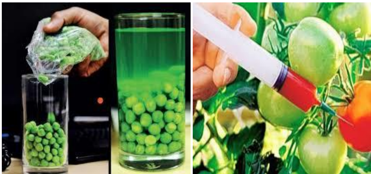
Figure 1: Adulteration by artificial colour mostly textile dye (Pune Mirror 2020).

The use of toxic chemicals in perishable foods is seen at the highest levels that endanger human life (Derek, 2013). The supply of unsafe food has a negative impact on public health, which is serious with acute and chronic diseases. (Rahman M, Sultan M, Rahman M & Rashid M 2015; Food Quality & Safety 2020)