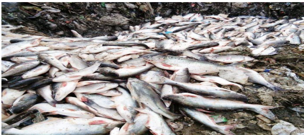
Figure 2: Formalin-laced fishes are seen dumped outside at the dumping site in Kohima (Morang express 2020)

The widespread applying of formalin in different fruits, vegetables, fish, meats and milks for long term preservation results of enormous threat to human health. Formalin (37 % formaldehyde solution) is traditionally used in industry for different expects but some unethical traders uses those liquids to preserve human foods which is harmful and toxic for human health. Formaldehyde is classified as a protentional human carcinogen, identified by the USA Environmental Protection Agency and International Cancer research Agency as a class 2A carcinogen. On this wise, the use of formaldehyde in food is absolutely unethical, toxic and forbidden. Still industrially it has high demand but the unethical use of formaldehyde in different foods by some dishonest traders resulting a hard-challenging situation for the consumers as well as for the government nowadays. Food adulteration is a crime which becomes a common practise by traders and suppliers in different markets all over Asia and some other European countries. This thesis aims to create awareness about formaldehyde and its adverse effects of its appropriate and inappropriate use for human health. The thesis mostly focused on the food adulteration by formalin (National Toxicology Program 2010). Figure 2 shows the dumped fish adulterated by formalin in India.