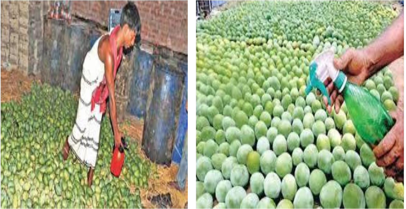
Figure 6: The solution of different chemicals spraying in fruits in Bangladesh (The Sunday Guardian Live 2020).

According to the association for human rights RDRS active in Bangladesh, has surveyed the markets of Dhaka and discovered that 71% of the fruit is treated with chemicals. In addition to formalin, the food is sprinkled with melamine and methanol, to make it look fresher. The figure 6 showing how different harmful chemicals are being applied in fruits to keep longer period or to ripe artificially.