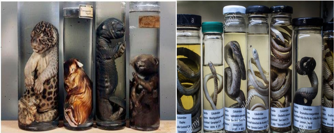
Figure 4: Animals are preserved by formalin.

Formaldehyde is used as a main chemical to manufacture many industrial products. Even if there are many uses of formaldehyde in our daily life. Formaldehyde solution known as formalin is used in laboratories for preservation of animal specimens. It is the most common chemical which is used in laboratories as preservatives. It is also known as embalming. In figure 3 can be see some examples of embalming by formaldehyde.