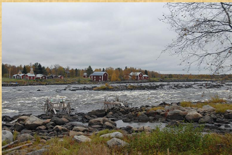
Kukkolankoski

Pub Wanha mestari Hallituskatu 5 95400 Tornio 016 430663 www.wanhamestari.fi