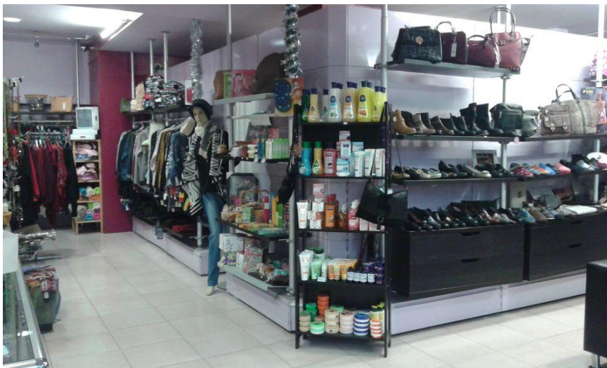
Figure 8.