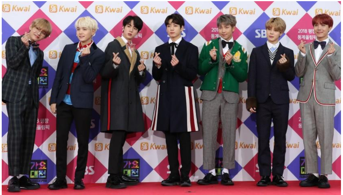
Figure4. K-pop: BTS Group (Korea)

Additionally, the above-mentioned saleswoman follows the K-Pop music genre, with bands such as BTS and Black Pink, and its Korean idol-inspired fashion which are sweeping among young people. It is more than noted that K-pop is a phenomenon of global success. Korean pop groups, whose stars are known as idols, have broken their borders and triumph around the globe, especially among young people, thanks to social media. (Cifuentes, 2020.)