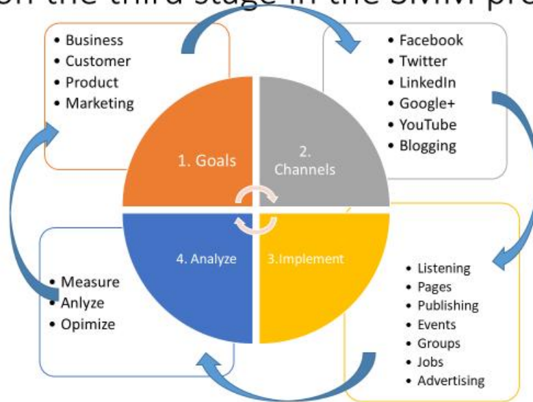
Figure.5- The Art of Digital Marketing (Social Media Marketing)

In B2B social media has evolved in different ways over the past decade, in terms of the number of customers using social media, and how customers use it for different areas of business (Hall 2020, 95).