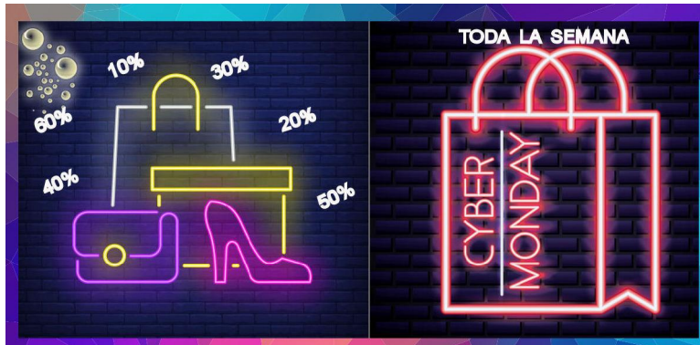
Figure 7. webpage of Xiroi (2020)