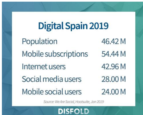
Figure 2. Digital Spain 2019. (Disfold, 2020)

The Spanish internet and e-commerce landscape counts tens of millions of users, but it is rather in the mid-sized range of markets compared to other countries like the US or even European leaders like the UK and Germany. With 42 million internet users, the Spanish digital population is still quite affluent and accustomed to e-commerce and its convenience. Spaniards often use both computers and mobile devices to access the internet and shop online for a wide array of goods and services.