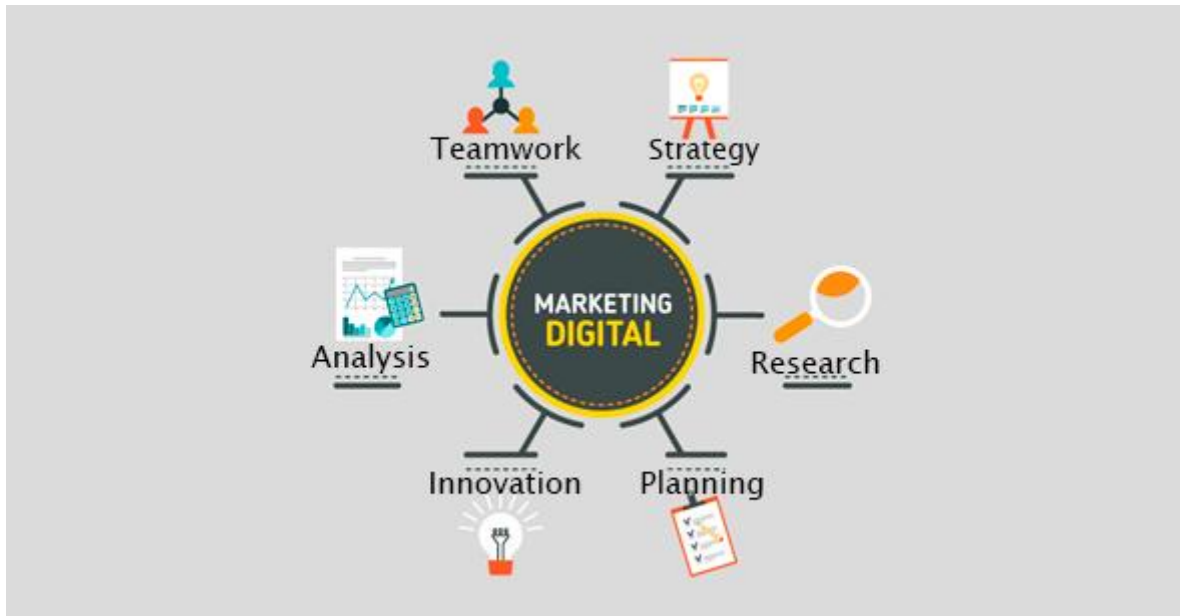
Figure 3. Marketing digital para emprendedores. (Pereda 2017)

Digital marketing for Xiroi entrepreneur is a fundamental and necessary tool to present a brand. Besides, it is always important that Xiroi stay informed about the trends in its niche and updates on its platforms. In the same way, Xiroi's entrepreneur has an innovative spirit with a great capacity to offer solutions to the vital needs of the market, a digital platform with the power of virtual distance such as Xiroi online shop