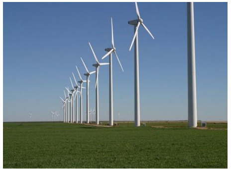
Table 6 Wind energy system (Electricity forum 2011)