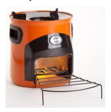
Table 7Biomass Stove (Electricity forum 2011)