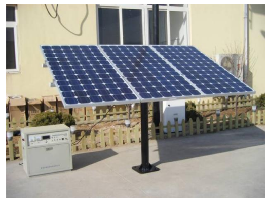
Table 5 Solar Energy system (Electricity forum)

Small scale wind energy systems – Small wind energy systems can be used in connection with an electricity transmission and distribution system these tend to have high capital costs but low running costs. Supply is intermittent and so energy storage is necessary for reliability. Wind is derived from solar energy. When the sun heats the earth's surface unevenly, it creates differences in air temperature and atmospheric pressure, which causes wind. Wind turbines for domestic or rural applications range in size from a few watts to thousands of watts and can be applied economically for a variety of power demands.