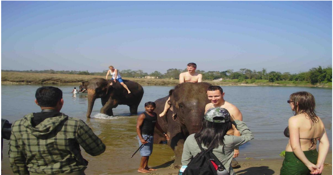
GRAPH 10. Elephant bath in Rapti River near Sauraha

In warm days the tourists get much entertainment from elephant baths. The elephant sucks the water from the river and sprays the water at visitor. The elephant rider shows different kinds of water spot activities from the back of the elephant.