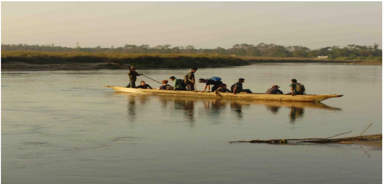
GRAPH 13. Canoeing on Rapti River

Oxcart is an interesting vehicle to use when visiting the village of Sauraha. Generally, third world countries tourists like to visit the village of Sauraha by oxcart. Most of the oxcart drivers are the Tharus.