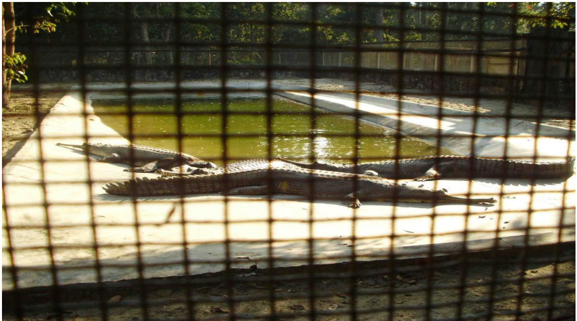
GRAPH 3. Crocodile (Gharyal) breeding center inside the Chitwan National Park

valuable horn. The price of horn is very expensive in international market. In 1960, the numbers of rhinoceros was dropped into 100. In 1988, the number of rhinoceros were 358 and in 2000 were 612. As per DNPWC report, there were 504 rhinoceros in 2010 inside Chitwan National Park. All over the Nepal there were altogether 534 rhinoceros in 2010. The food for rhinoceros is grass species. Rhino lives in sub-tropical climate with alluvial flood-plain where green grass is available all over the year. (WWF 2011; DNPWC 2010.)