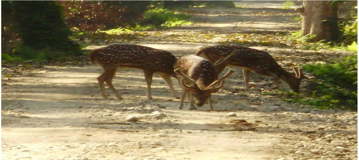
GRAPH 4. Chital (spotted deer) inside the Chitwan National Park

of the attractions in this national park. There is center amount for entrance fee to see this breeding center. (Ballouard & Cadi, 2005; DNPWC 2006.)