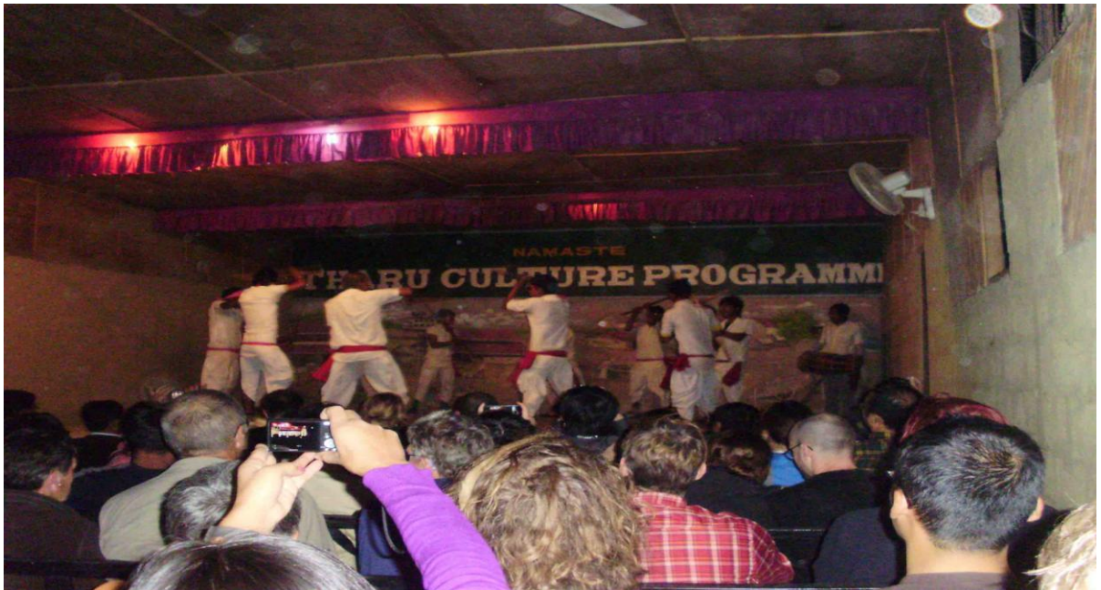
GRAPH 9. Culture programme shown by Tharus

Tiger Top Lodge, Gaida Life Camp, Machan Wild life Camp, Temple Tiger are inside the national park. They are high class hotels and resorts and others are in Sauraha, buffer zone area of the national park. The price of hotels and resorts are varying according to the stander of hotels and resorts. The Tharus has made some hotels and resorts in traditional way. As tourists want exotic and unique things, they like to sleep in the traditional type of hotels and resorts. Some Tharus have also share room for tourist as a lodge. They will also cook traditional food for them. They get friendly environment in this type house. In above table, some famous hotels and resorts are only shown. Tourism business has been generating employment in Sauraha which directly and indirectly benefited the local people. (Wapanepal 2010.) The tourism attractions in Sauraha are as follows: