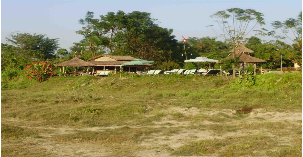
GRAPH 15. Restaurant in Sauraha near by bank of Rapti River

found that the Tharus are working as waiters, room boys, cooks, utensils washers etc. As the Tharus are not more educated and skillful than the hill migrants, the Tharus have been working in lower position with lower salaries.