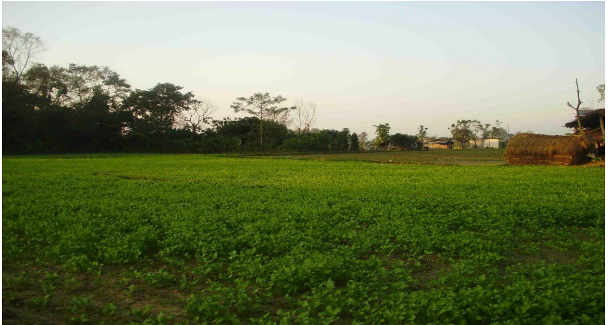
GRAPH 8. Mustard field in Sauraha, Chitwan

The main crop of the Sauraha region is mustard cultivation. Mustard seed is used for cooking oil and other purposes. The Sauraha region is very good for mustard. They export the mustard oil to other districts as well. Tharu and forest are interrelated to each other. After the malaria eradication, the hill people shifted to Chitwan district, so the Tharus are a minority in this region. (McLean, 1999.)