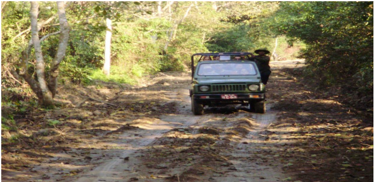
GRAPH 12. Jeep safari with tourist guide inside the Chitwan National Park.

In Sauraha, there are different kinds of employment generated from tourism industry. Some of them are tourists and nature guides. During field visit, the author received the information that there are 25 travel and tour offices in Sauraha. These travel and tour offices had 400 tourists and nature guides. Among them 40% are only Tharu tourists and nature guides and the rest of them are Hill migrants. The author also found out that most of the hotels and resorts also have one tourist and nature guide which help to visiting tourists especially from third world countries tourists.