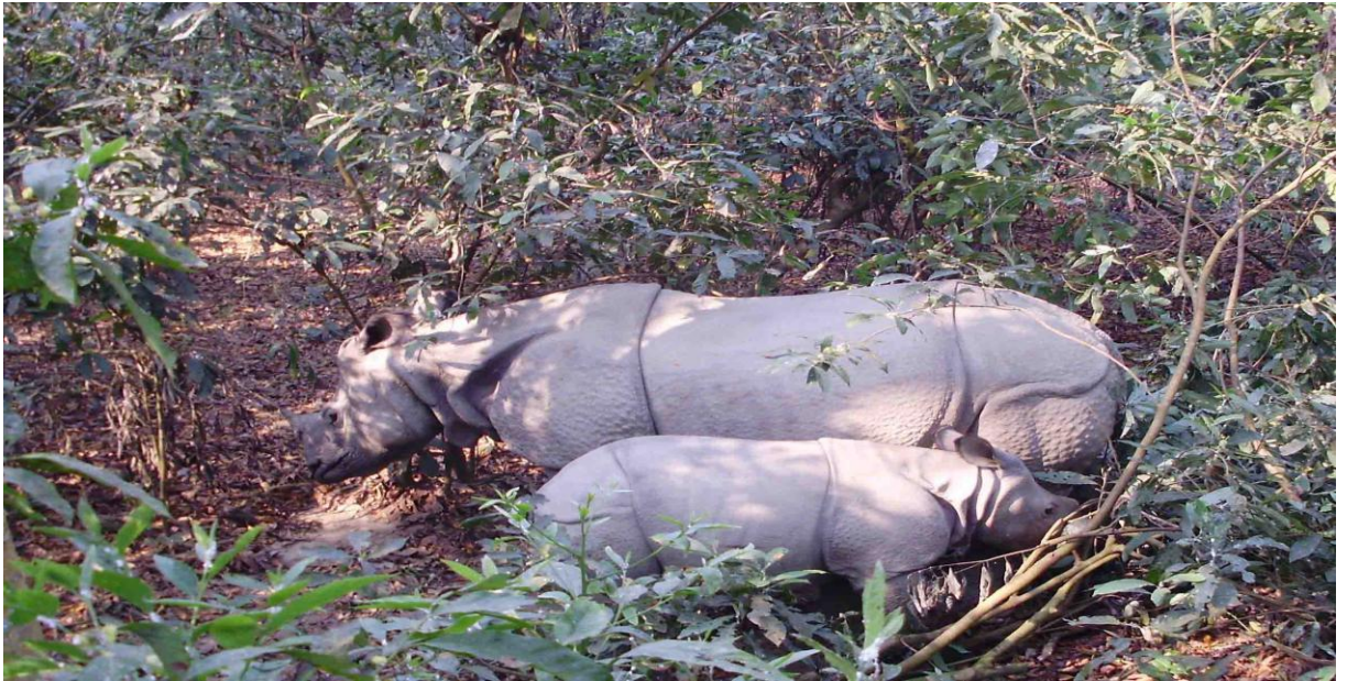
GRAPH 2. One horned rhinoceros

The main occupations of surrounding people are agriculture, tourism and trade. (Nepal Culture Travel & Tourism, 2011.) The indigenous and ethnic people such as Bote, Darai, Kumal and Tharu have been found in this area. Among them the Tharus have the larger population in the area. (Pilgrims 2007). The Chitwan National Park is the collection of flora and fauna; there is lot of things to see. One time is not enough to see all the animals and plants. To see rare animals inside the national the visitors also to be luck. Different kinds of tourists come to see here. Some of them are animal expert, bird expert, forestry expert and some of them are natural lovers also. The main attractions of Chitwan National Parks are as follows: