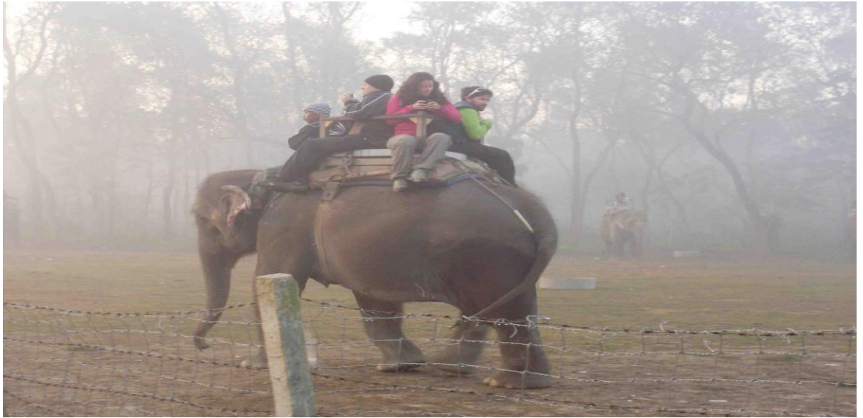
GRAPH 14. Jungle safari with elephant riding in the buffer zone community forest

The elephant riding is also one of the major activities in the Sauraha. Tourists are interested for jungle safari and they visited in the buffer zone community forestry with elephant riding. In the Sauraha, there are 65 elephants which are the owned by the private sector. These elephant riding services are provided with the elephant cooperative center on syndicate system. The elephant riders are Indian people, some are Bote, Kumal and some are Tharu and others are from eastern part of Terai region of Nepal.