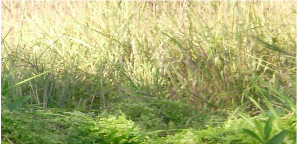
GRAPH 6. Grassland inside the Chitwan National Park

A total of 5520 ha of grassland is distributed in patch form in the Chitwan National Park. The greater parts are distributed in the central (3149.7 ha) and eastern (1309 ha) part of the park. In 1970 grassland covers 20% of the total national park area. Grass land is important food source for rhinoceros, elephants and different types of deer's. The grassland is home place for different kind of birds. To preserve the grassland area the national park has cut and uprooting the unnecessary other species from it. Every year in February and March the grassland has cut and burning. This makes good for new coming new grassland in the area. (Nakarmi 2007, 20; Chitwan National Park, 2011.)