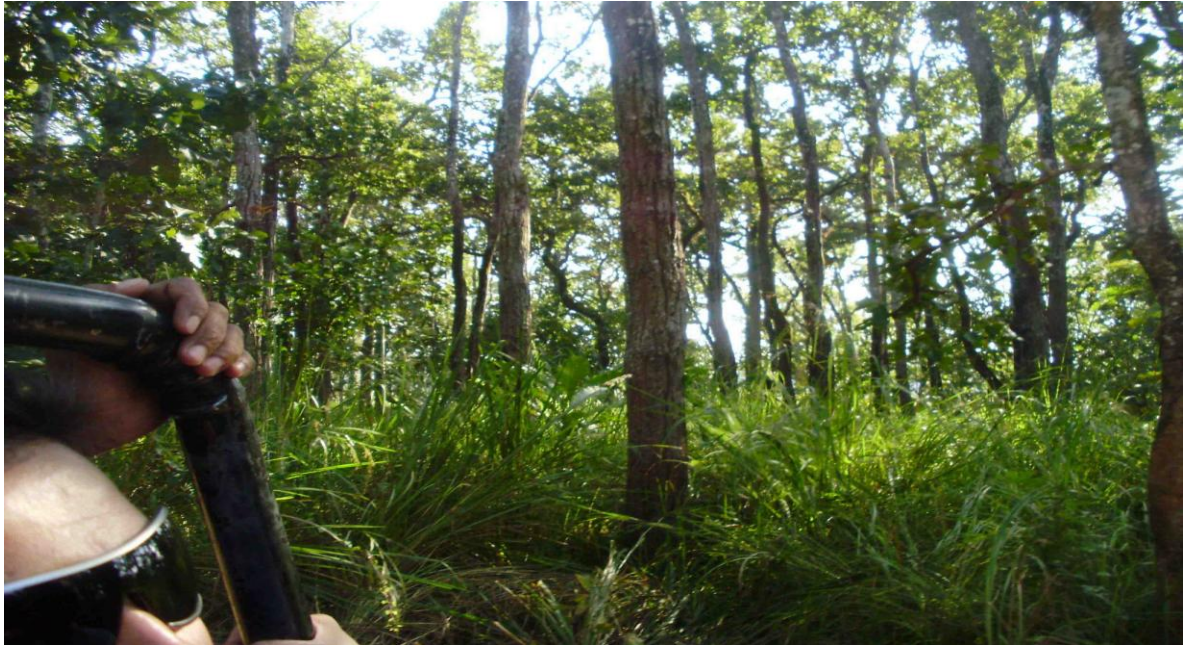
GRAPH 5. Sal Forest ( Shorea robusta )

Dicotyledons, 137 Moncotyledons and 16 Orchids. The endangered floras are cylas tree and screw pine. (Nakarmi 2007, 19.)