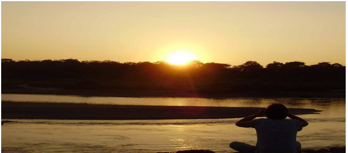
GRAPH 11. Sunset view from Sauraha

In warm days the tourists get much entertainment from elephant baths. The elephant sucks the water from the river and sprays the water at visitor. The elephant rider shows different kinds of water spot activities from the back of the elephant.