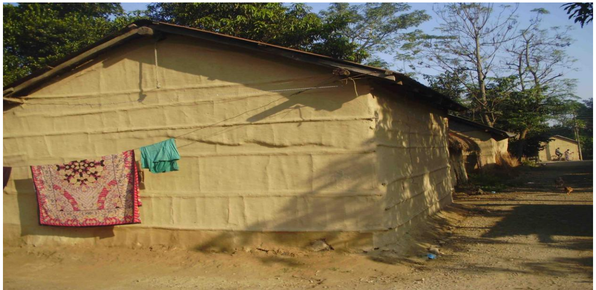
GRAPH 7. Typical the Tharus house in Sauraha, Chitwan

According to Nepal census of 2001, the total number of population of the Tharus is 1,533,879 in which the percentage is 6.75% of total population of Nepal and 5.86% people speak the Tharus language of total population of Nepal. They are living at the edge of the forest, farming and raising livestock on the plains. They depend on river and forest products such as hunting animals in the forest for meat, collecting fruits, roots, herbs and fish. Their main food is rice with fish. Other foods are chicken, pork, rabbit, pigeon, tortoise as well as Dahl and vegetables. Women make homemade alcohol from wheat and barley. (CBS 2001.)