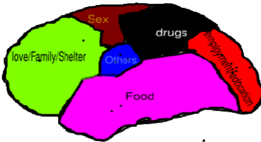
FIGURE 2. (Drawn by use of elker sketch art.) Thoughts of a street child

Street children are people who care and are aware of what is happening around them. There are several things a person may find him or herself think about all the time. As for a street child during the conducting of the interviews and also from the observations, several things never missed in a street child's vocabulary and they have been represented below with the use of a brain diagram.