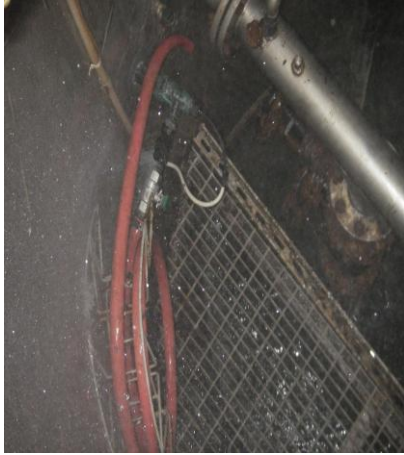
PICTURE5.4 Leaks from the pipe inside pump station (Obijaju, 2011)