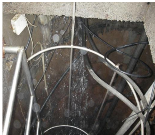
PICTURE5.4 Leaks from the wall of a Pump station (Obijaju2011)