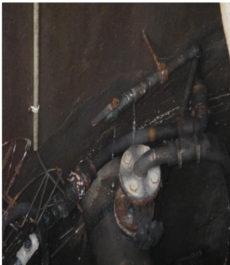
PICTURE 5.5 Little leaks from the pipes in a pump stations (Obijaju, 2011)