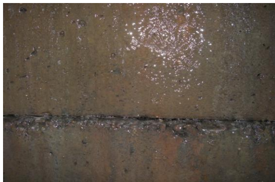
PICTURE5.1 Leaks from the walls and seams of the Manhole (Obijaju, 2011)