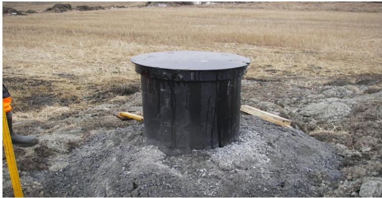
PICTURE4.3 Plastic Manhole (Peter Obijaju, 2011)