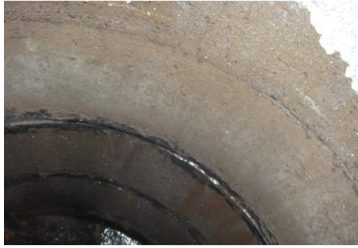
PICTURE 5.2 Leaks from the lower part of Concrete manhole (Obijaju,2011)