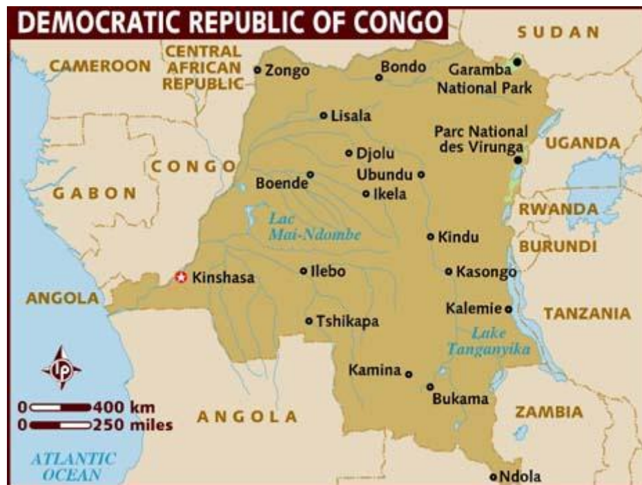
Figure 1: Democratic Republic of Congo.

The Democratic Republic of Congo (DRC) is a country that located in Central Africa and is nowadays the second largest country in Africa after Algeria. The capital city is Kinshasa. In entire world it is the eleventh largest country. It shares borders with nine nations including Zambia, Rwanda, Burundi, and Republic of the Congo, South Sudan, Uganda, Tanzania, Central African Republic, and Angola. The figure below shows the map of Democratic Republic of Congo.