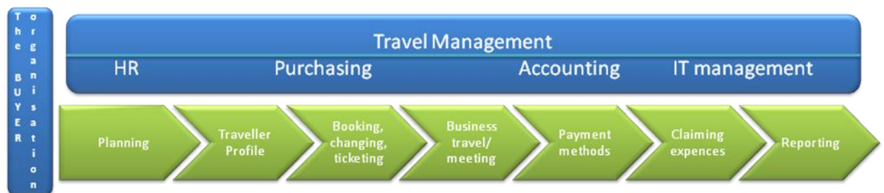
Figure 1: Travel Management process

The travel process involves many parts that we look at in the following chapters.