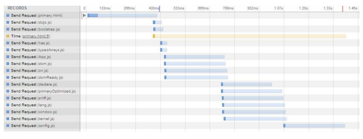
Figure 3. AMD module loading timeline

Figure 3 show that the Dojo Toolkit 1.8 AMD compliant module loader loads the modules in parallel fashion.