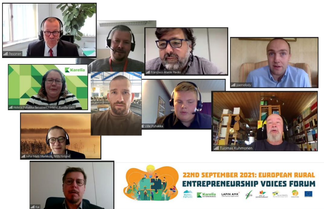
Picture 1. European Rural Voices Forum brought together experts and entrepreneurs to vision the future for European rural areas.