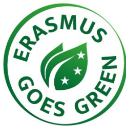
Figure 1. Logo of the project

Erasmus Goes Green -project aims at lowering impact the Erasmus+ programme has on the environment. Main objective of the project is to find solutions to reduce the transport-related carbon footprint of higher education students and staff taking part in Erasmus mobility. Logo of the project is shown in the Figure 1. (Erasmus Goes Green 2021)