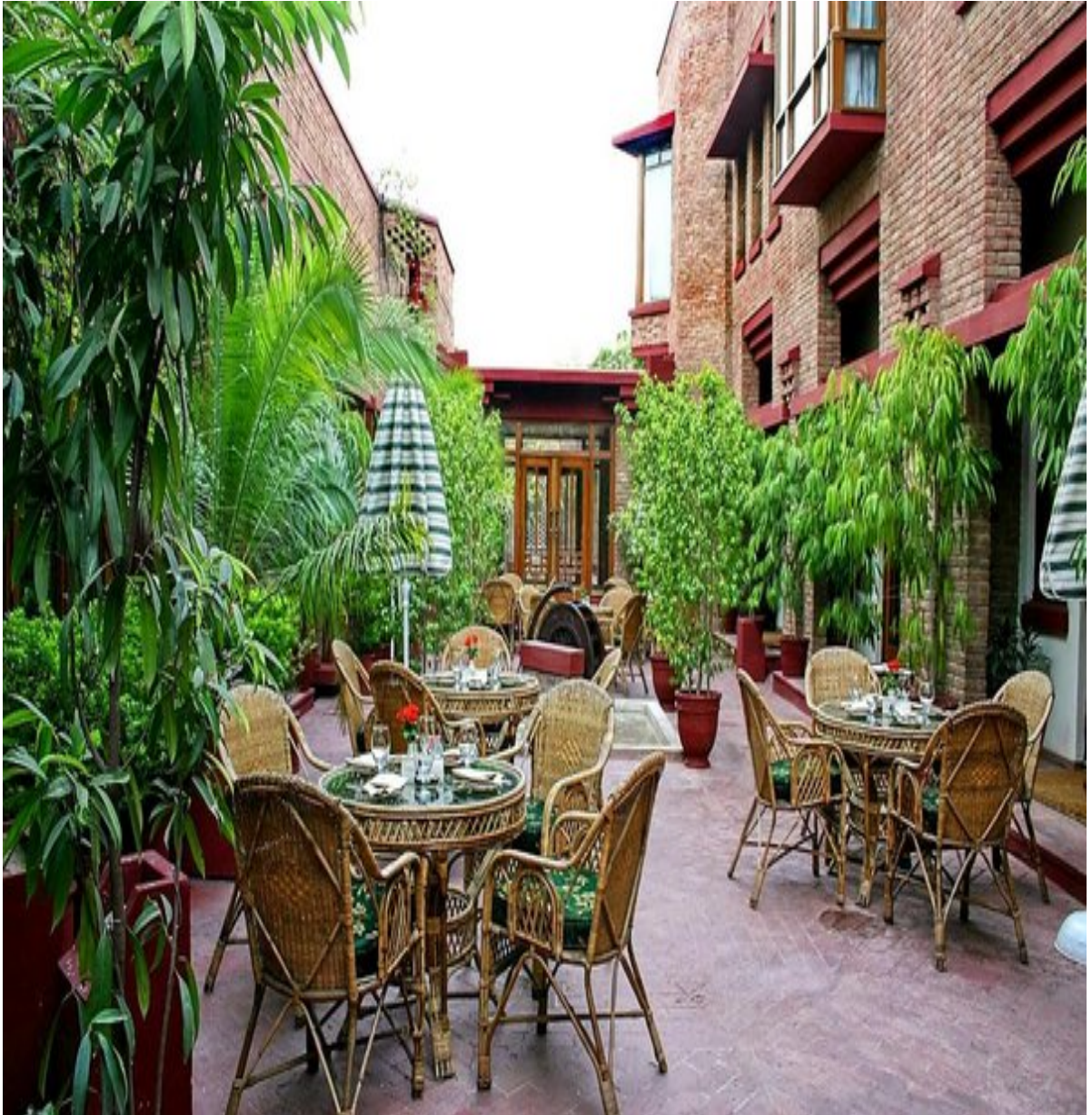
GRAPH 2. Outside view of Faisalabad Serena Hotel

The Serena Hotel Faisalabad is taking good care and pays proper attention towards the security and well-being of hotel guests. There has been an all-time alert security system with upgraded high tech, and a revised Crisis Management Plan in place so as to tackle any unforeseen incident. Below is a graph of the outside view of Faisalabad Serena Hotel (Graph 2).