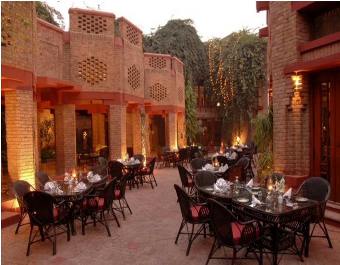
GRAPH 3. Hotel Street Gallery

The President of Pakistan General Muhammad Zia-ul-Haq has launched Serena Hotel in 1987. Serena Hotels in Islamabad, Swat and Gilgit are located amidst the most attractive areas of Pakistan and furnish mostly to the travelers for holiday purpose. The building of Faisalabad and Quetta Serena Hotels have been designed and built according to the Serena standard. Below is the (graph 3) hotel street gallery.