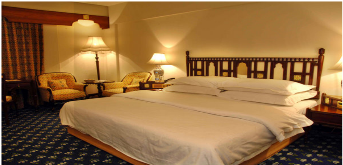
GRAPH 4. An inside of Hotel Serena's room

[The Goal of our organization is to meet and exceed guest's expectations.]