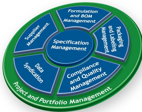
FIGURE 3. Agile PLM – structure (Oracle, The PLM Journey at Raisio)

carried through rapidly and efficiently. (Oracle: Agile Product Portfolio Management, 2012.)