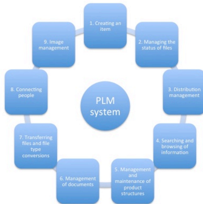
FIGURE 1. PLM system structure

A new item is created when a company puts a new product, ingredient, component or material to the PLM system.