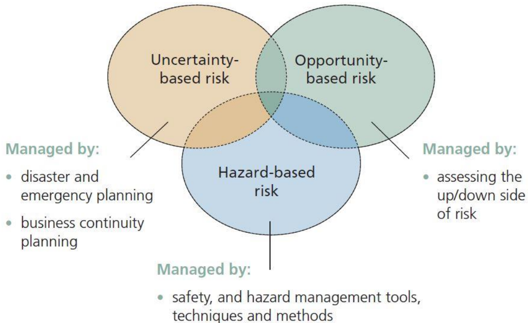
Figure 1 Three types of risk and their management. Risk Management Guide for Small Business, by Global Risk Alliance. 2005. p10.

Risks or uncertainties have their own distinct characteristics which call for particular assessment and management strategies. The Global Risk Alliance (2005) discussed that there are three types of risks as in Figure 1 below.