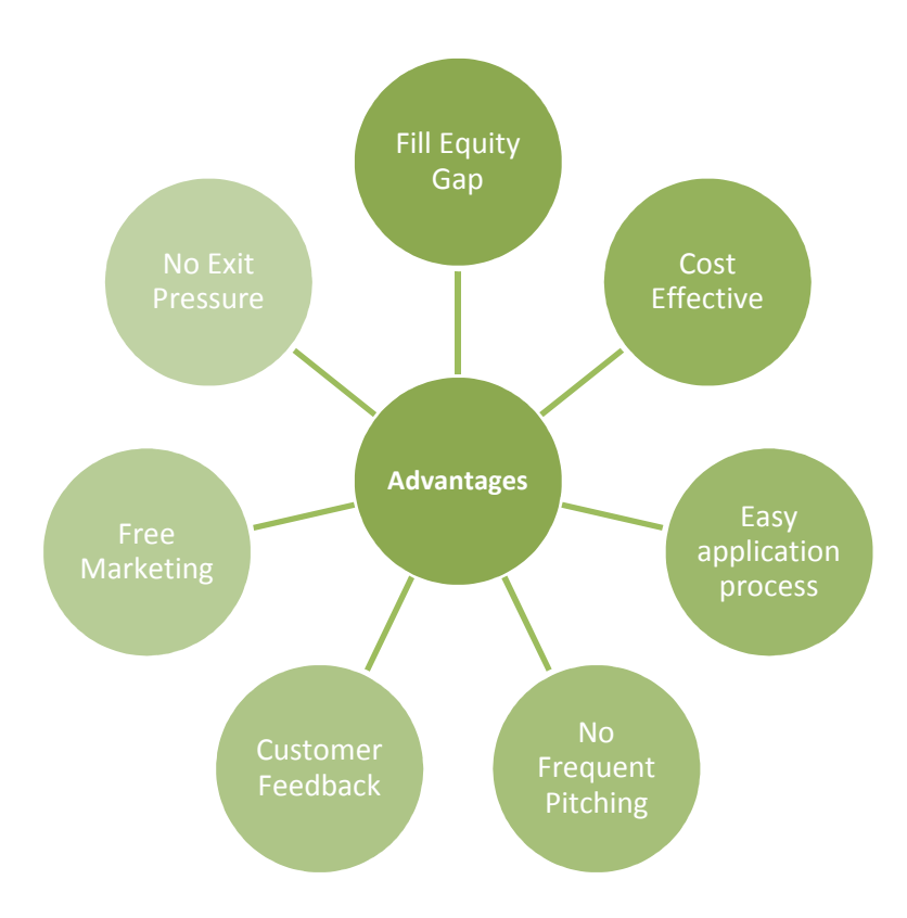
Figure 3: Advantages of crowdfunding