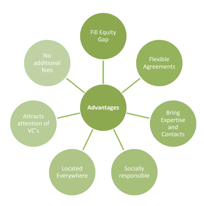
Figure 1: Advantages of business angels