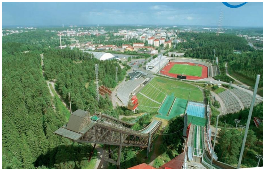
GRAPH 2. Views of the sport center and surroundings from the tallest ski jump hill (adapted from urheilukeskus / sports center Lahti 2013)

Amongst these sport related attractions, the most important one is the sport center. This sport center has gained international recognition after having successfully hosted six championships in the Nordic ski event and the annual Lahti ski games. It hosted the world championship in skiing as early as 1926. This sport center is made up of a skiing stadium, a football stadium, athletics stadium and the iconic ski jump hills. The ski stadium alone has a carrying capacity of 30 000 spectators while the athletic stadium has the carrying capacity of 30 000 spectators. On its parts, the tallest of the ski hills is 133 meter high and on both side of this hill, there are two hills of 50 meters and 70 meters high. There is an elevator on the top of the highest hill which can be reached by an elevator for tourist to get a fascinating view of the sport center and the town (Sport center Lahti 2012.)