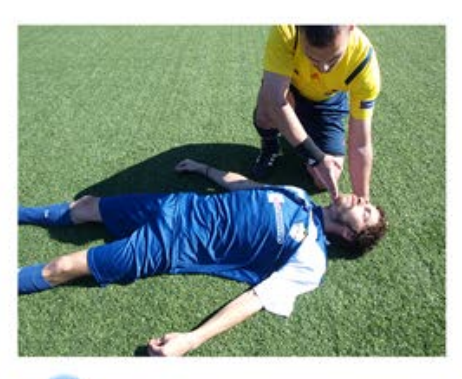
Open airways by raising the chin up with one hand