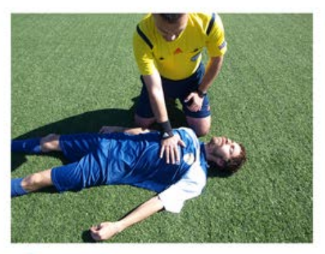
Place the heel on your hand on the middle of the breast-bone