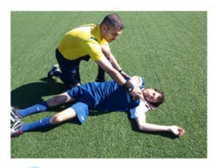
Place the other hand on the other's side's cheek