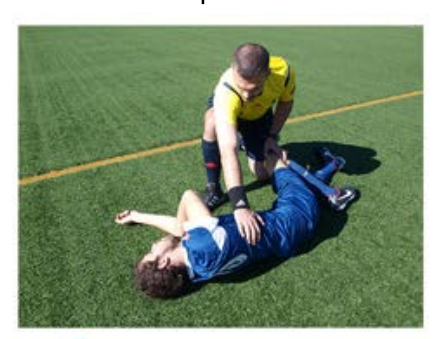
Pull towards you ultil person lies on his/her side