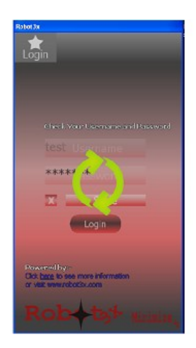
Figure 2.1: Interface for Robot3x software.