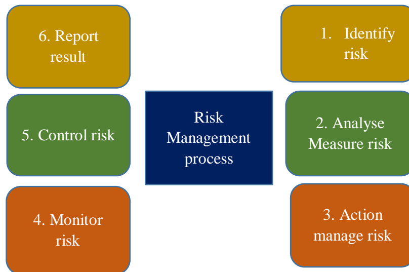
FIGURE 2: Risk management, (Adapted from Finrepo 2022)

A risk management strategy can overcome some risks. Small businesses may close due to poor management, and it is challenging for those who enter the market without business experience about starting a small business. Such administration can fix the management, improvement, and future-oriented business activities. (Finrepo 2022.)