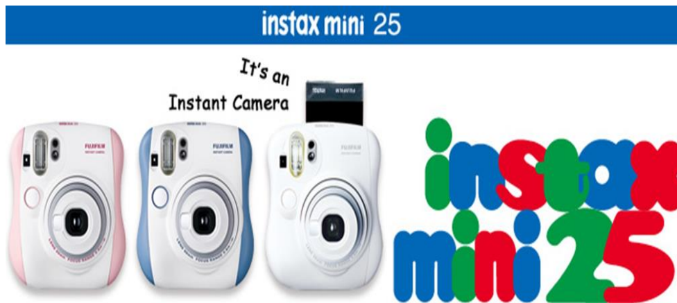
Figure 10. Picture of Instax mini 25 (Fujifilm 2014c)

The Fujifilm Mini 25 series has a lot of features that could be addressed. With lighten-darken control, the intensity of colour brightness could be adjustable while the camera itself has two shutter buttons on the body to make vertical and horizontal shooting easier. When using fill-in flash mode, background could be captured clearly even in dark rooms with automatic control of shutter speed from the camera. Besides close-up lens for creating enlarged images of the subject, the Instax 25 has another built-in self-snap mirror which is very useful to take perfect self-shots. (Fujifilm 2014c.)