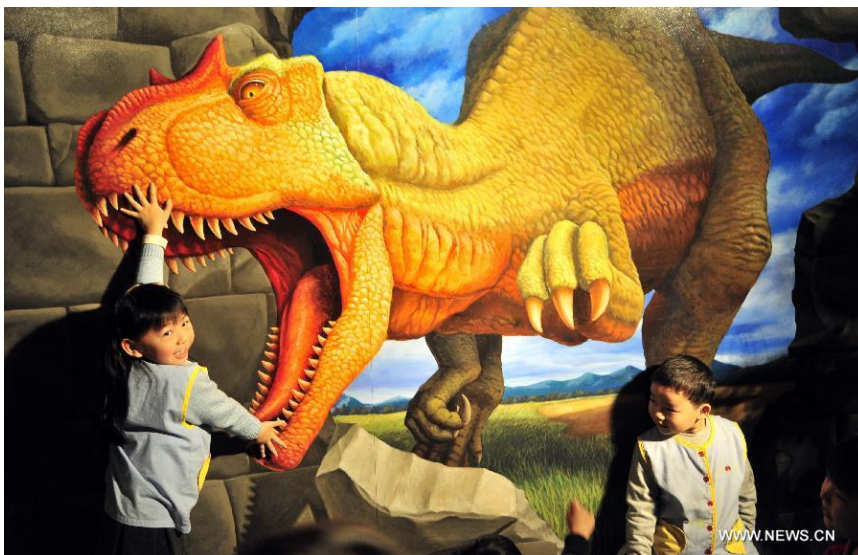
Figure 1. Example of 3D Painting (Xinhuanet 2014)

The Common room functions as a typical coffee shop which offers customers a cosy place and primarily serves them prepared espresso-based coffee drinks and other light snacks such as pastries with free Wi-Fi internet service. The Common Room is the biggest room with the capacity of around 25 people. It is the first room that customers will see when they step inside the shop. This room functions as a typical coffee shop in which customers can grab some drinks or food and choose a table to sit down. Music will be played in the background and there is a LCD to display movie trailers or products, services and events of Cinxtant. The Common Room is decorated with 3D paintings positioned on the walls. In general, 3D paintings are products of the 3D art, which is the art of producing representations of natural components or imagined forms in the three dimensions. (Ask 2014; Overstock 2014.) The 3D paintings are changed occasionally.