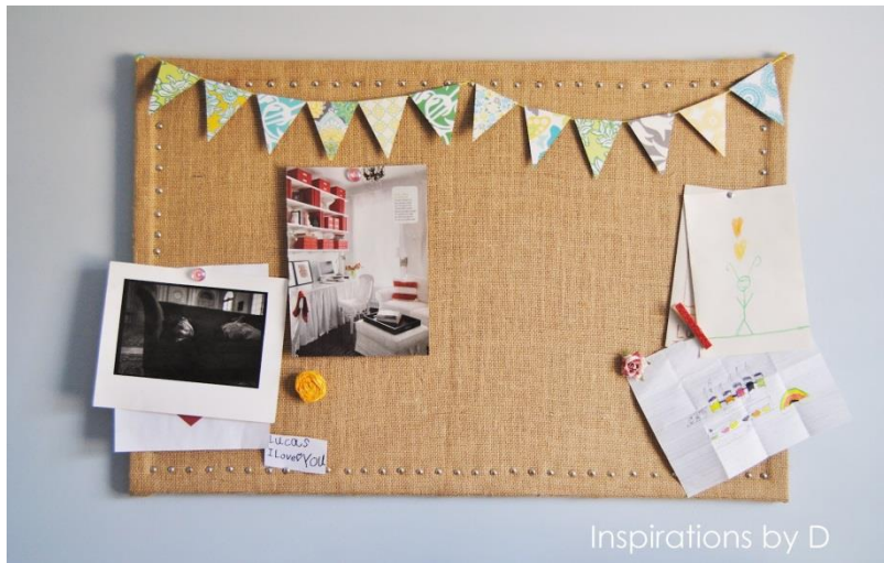
Figure 13. Example of instant photo pin board (Inspirations by D 2010)

As to school projects, Cinxtant plans to provide projects for students in institutions in Finland to further research or develop the business. HAAGA-HELIA University of Applied Science is expected to be the partner of Cinxtant in this matter. By this way, besides the benefit of gathering new ideas and researches from the students' work, the coffee shop also get its image more well-known, especially among students as to be able to complete a project with flying result, students need to study a lot about the commissioned organization. Thus, this is also an essential channel that Cinxtant should take into consideration.