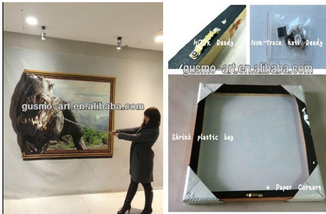
Figure 15. Front and back side of 3D wall art painting sample (Alibaba 2014a)

It is not difficult to stick 3D paintings on the wall, especially wrapped and stretched on durable wooden frame. Various types of 3D wall-art painting which are made from environmental friendly oil and 100% handmade paint will be purchased from Xiamen Links, Xiamen Gusmo and Shenzhen Yinte Painting Art & Craft Co., Ltd by co-authors. Depend on different times; the decoration of 3D paintings will be applied occasionally to create the unique theme and freshness of Cinxtant coffee shop. Same to commodities of coffee stock required, multiple options of suppliers for 3D wall-art painting was listed out in order to prevent the risk of dependency and high bargaining power from a primary dictator in term of price, quality, availability and shipping schedule. (BDC 2014, 54.) In particular, the business owners like co-authors might select several alternatives of available sources to purchase reasonable and affordable items with their circumstances.