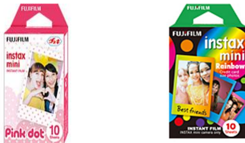
Figure 9. Accessories for Instax mini (Fujifilm 2014b)

With the plain white edge above, customers could write their own notes for keeping and saving remembrance. Besides, there is a wide range of styles for frame design to choose from such as colour, rainbow, etc.