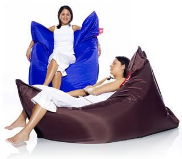
Figure 7. Fat boy beanbag. (Home Improvement School 2014)

With the help of the high definition visual and 3-dimensional technology as well as sound effects, customers would immerse a lot of memorable and meaningful experiences by the emotional characters, the storytelling and the virtual environment surrounding. There are lots of pillows inside the shop as well as Fat boy beanbags in cinema rooms in order to really immerse the customers into the extraordinarily relaxing experiences in the shop.