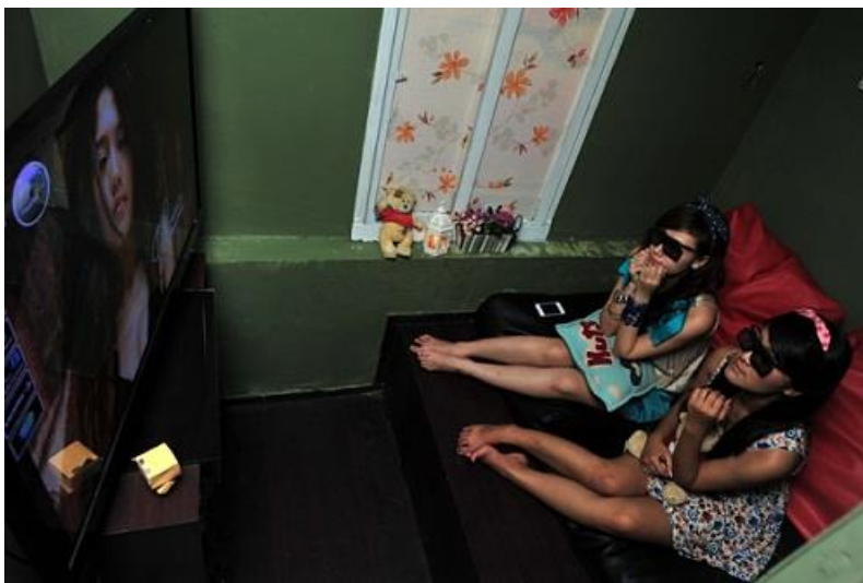
Figure 5. Cinema 1 symbolic design. (Café Saigon HD 2014)

cheaper price compared to watching in the local Cinema. Moreover, customers would have for themselves more private spaces to have good time and enjoy the high quality cinematic experience. Cinema rooms are both smaller than the Common Room. Cinema 1 is the smallest room which has two seats for two customers to watch movies in the room. As for Cinema 2, it has a bigger area which provides 8 seats for 4 to 8 customers. Customers will pay for the duration of staying in the Cinema rooms. The Price for each hour in Cinema 2 (Large room for 6 people) is higher than in Cinema 1. Customers can watch downloaded movies from the HDD or from online source which the owners have subscribed to.