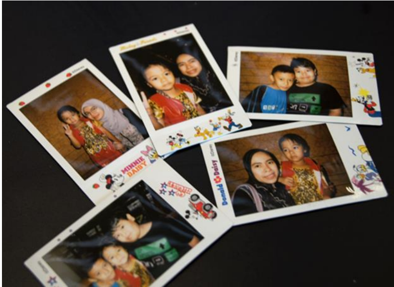
Figure 12. Portrait and landscape photos from Fuji instant camera (Saffawati shop 2012)

The combination of “Instant photo” service and 3D wall art would improve customer engagement and increase revenue for the high-tech café model of co-authors. In summary, Cinxtant hopes that customers would be more interested in the exciting experience of receiving and sharing their tangible and exclusive photos with closest friends than scrolling through virtual and digital images on the screen of mobile devices. It is also grateful for Cinxtant to give old school style photographs to customers as interesting and unique gift in order to bring back their emotional and nostalgic memories.