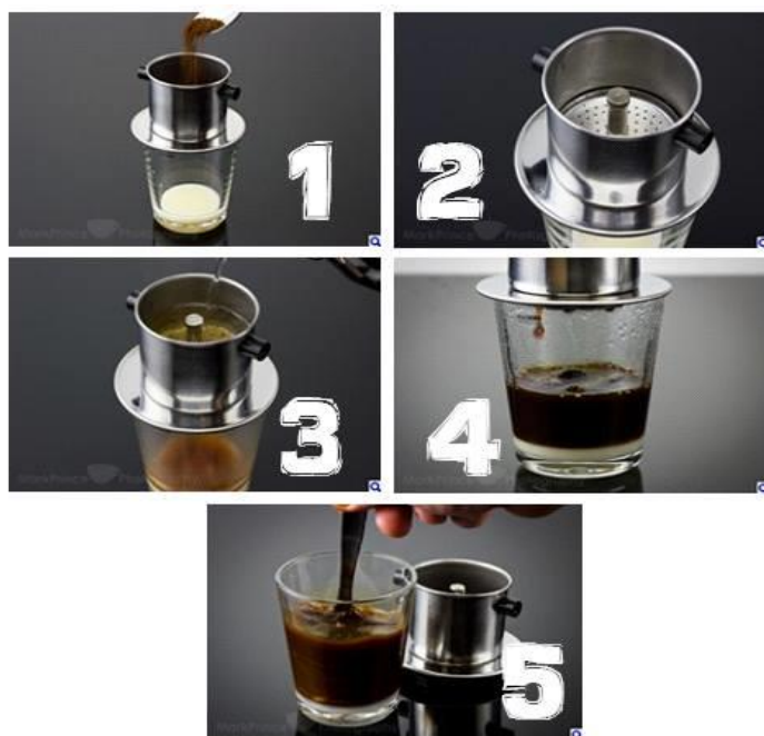
Figure 4. Step by step to make Vietnamese style coffee (CoffeeGeek 2011)

should be waited for drips of 3 minutes. Finally, after removing the filter, coffee would be ready to stir and serve with ice (optional). (Trung Nguyen Online 2013.)