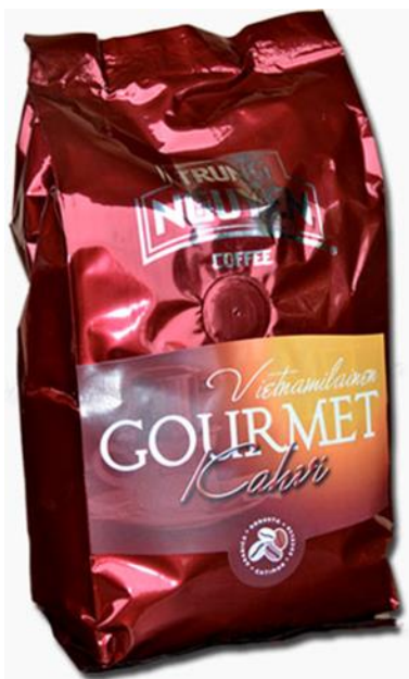
Figure 3. Picture of Vietnamese Trung Nguyen coffee package (Gourmet-kahvi 2014a)

In addition, Paulig Espressos products could be used as basic ingredient for barista to make other Italian coffee drinks such as latte, mocha, and cappuccino at the high-tech café (Paulig 2014c). Due to globalization, young Finns have begun to expose to variety of specialty coffee trend from other countries (Ojaniemi 2010). To enrich the menu of coffee specialty, authentic Vietnamese coffee drink is offered to the customers who would be willing to experience a new taste of cultural beverages. The Vietnamese coffee product used to serve customer is from Trung Nguyen brand. As a huge brand in Vietnam with its recognition in international market, Trung Nguyen highlands gourmet coffee would bring an excellent taste of Vietnamese genuine coffee to Finnish customers.