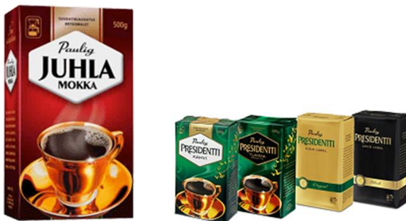
Figure 2. Pictures of Juhla Mokka and Presidentti packages (Paulig 2014a; Paulig 2014b)

In general, the main concept of high-tech coffee bar from co-authors will be focused on the type of Espresso bar model. However, the traditional Finnish coffee is not excluded from the menu. (Coffee/Tea 2014) In Finland, people are more preferred the light roasted coffee than dark roast coffee (Etl 2012). Moreover, among Finnish coffee brand, Paulig Group has become one of the top and superior leading companies in Finland market nowadays, especially with 58% market share in the product ranges of Juhla Mokka and Presidentti (Kauppalehti 2004). As a result, co-authors have decided to choose these two Paulig coffee products to serve traditional Finnish coffee to customers. With strong and unique flavour of light roast coffee bean, these two products will absolutely comfort customer expectation.