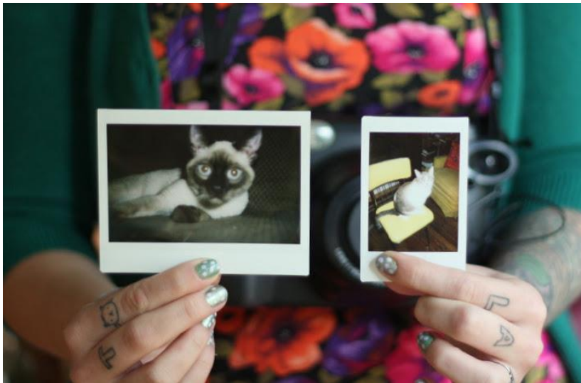
Figure 8. Size comparison between mini and wide films (Saffawati shop 2012)

After reading many reviews and considering the budget, the co-authors have decided to choose instant cameras from Fujifilm, with two models of Instax mini 25 and Instax 210. Instax series is the instant camera brand from Fujifilm that has two formats of self-developing film, including “mini” picture size of 62 (H) x 46 (W) inches for Instax mini 25 and “wide” picture size of 62 (H) x 99 (W) mm for Instax 210. (Fujifilm 2014a.)