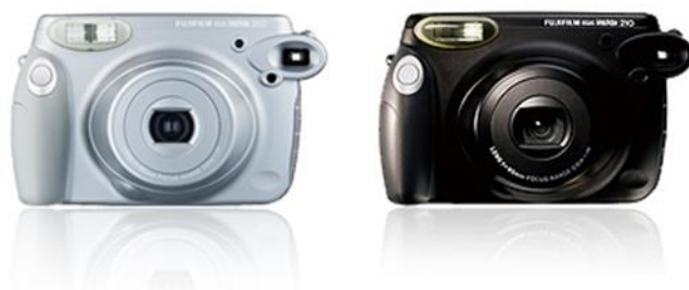
Figure 11. Picture of Instax mini 210 (Fujifilm 2014d)

This product is quite matched for making self-portrait photograph (regular size of credit card) or taking picture with two persons. On the other hand, the model of Instax 210 is quite suitable with occasion and special event for taking group photo of 3 to 5 people gathering together. The camera itself has a stylish body with three exposure light-control settings and automatic electronic flash, including with a close up lens of expanding photo shooting range. (Fujifilm 2014d.)