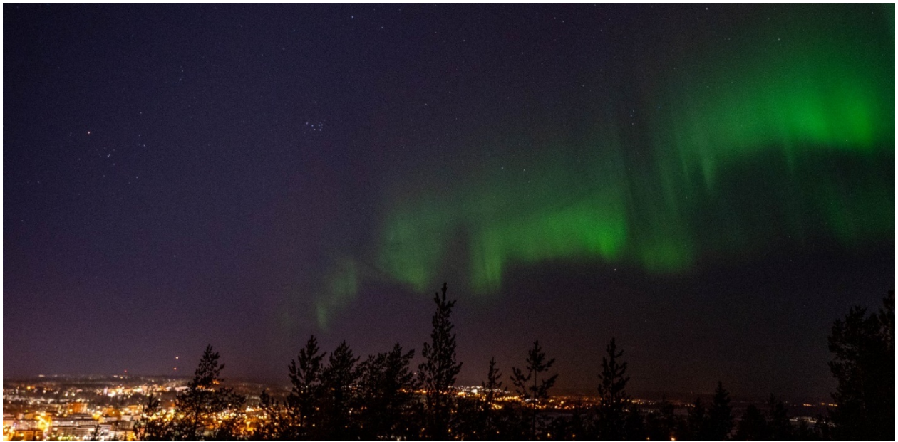
Picture: Northern Light at the campfire, Ounasvaara