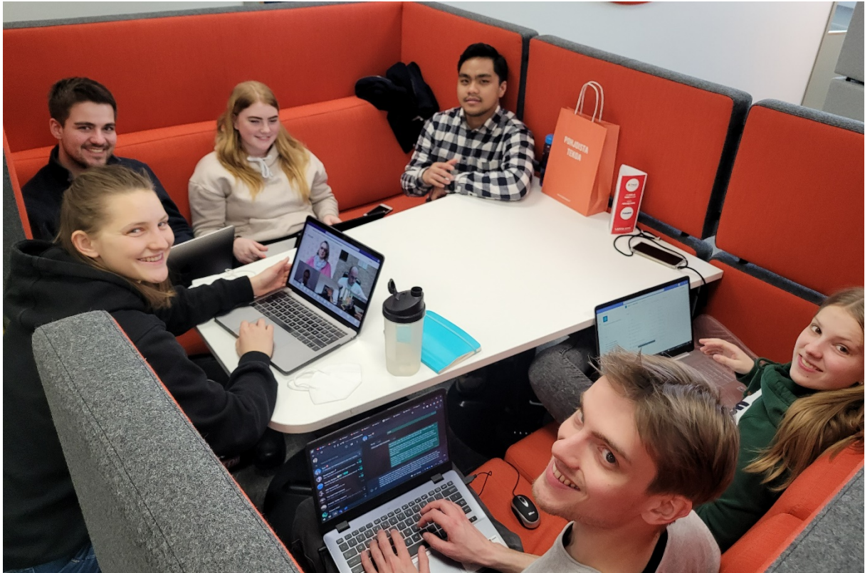
Picture: students rejoin on campus after 6 weeks online