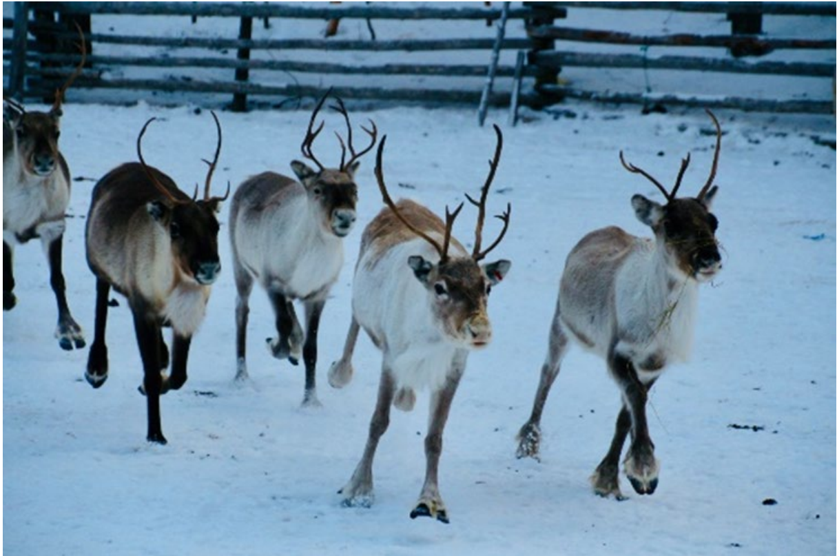
Picture: reindeers running during the visit of the reindeer farm

The day was concluded at the accommodation in Vasatokka, and then experiencing how to make a real Finnish sauna. The day ended with an incredible evening, all together having laugh, dance and singing joy. It was an unforgettable moment for all of us. In the final day of the trip for the thrill-seekers, it was snowmobiling tour in the morning. We could drive on the frozen lake of Inari and see the numerous islands, as well as drink a hot drink and eat a biscuit followed by photos with the snowmobiles. On the way back to Rovaniemi, we stopped in Levi, a Finnish ski resort located in Lapland, for most of us it was a warm coffee break while discussing the incredible trip we had just lived.