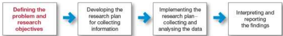
Figure 7. The process of marketing research (Kotler et al. 2017: 109)

enterprise to investigate a specific problem. Secondary data means the data already exists and is organised to study a particular situation. The last step is the presenting report. It's essential to consult with the marketing specialists who have the most insight into the issues when interpreting the results at this stage. The objective is to deliver the results to management in a form that aids decision-making. (Kotler et al. 2017: 109-124)