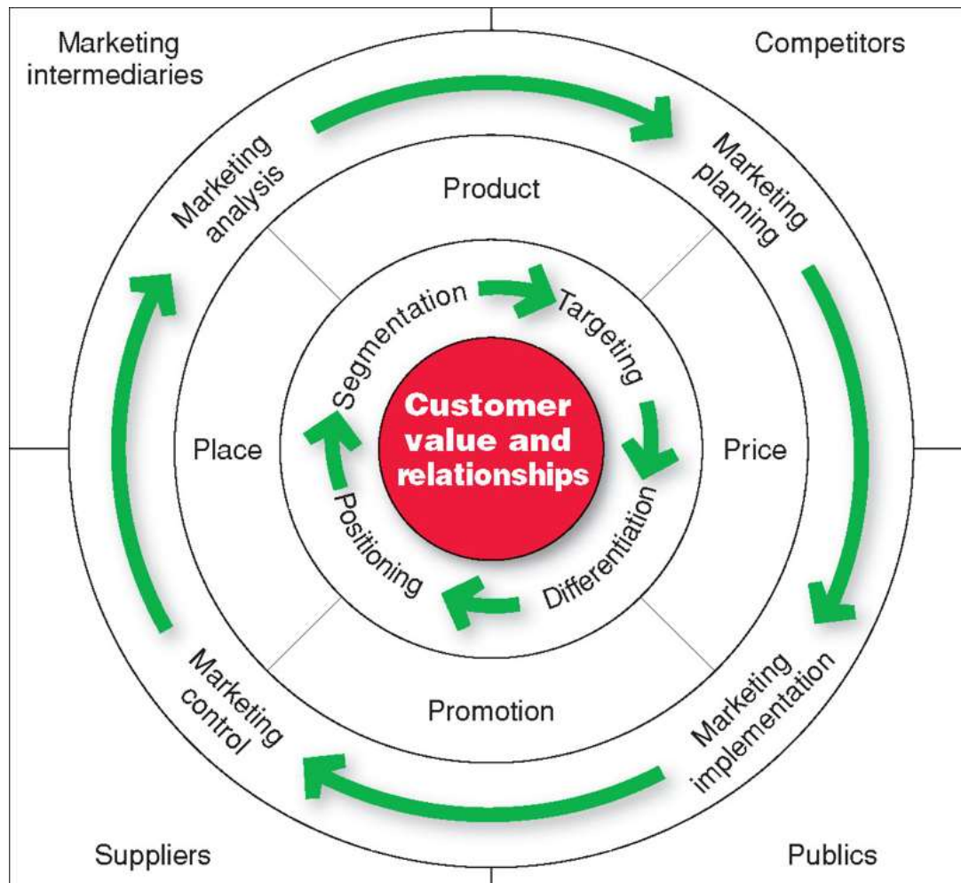
Figure 1. A structure of marketing strategies (Kotler et al. 2017: 47)

In a promotional strategy, companies should communicate their customer value clearly and persuasively to achieve their sales goals. There are various tools for promotion strategy. Enterprises need to build a consistent, clear, and compelling message for their brands to engage and attract customers.