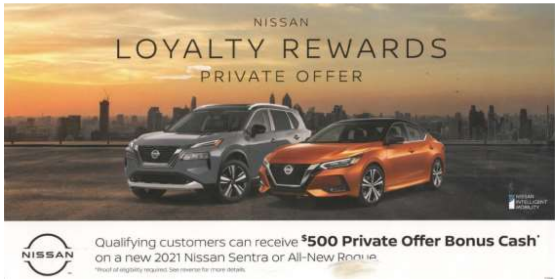
Figure 6. A Nissan promotional loyalty. (Bobnak 2021)

capitalises on exclusivity via an emotive copy driver. A monetary reward of $ 500 is offered.