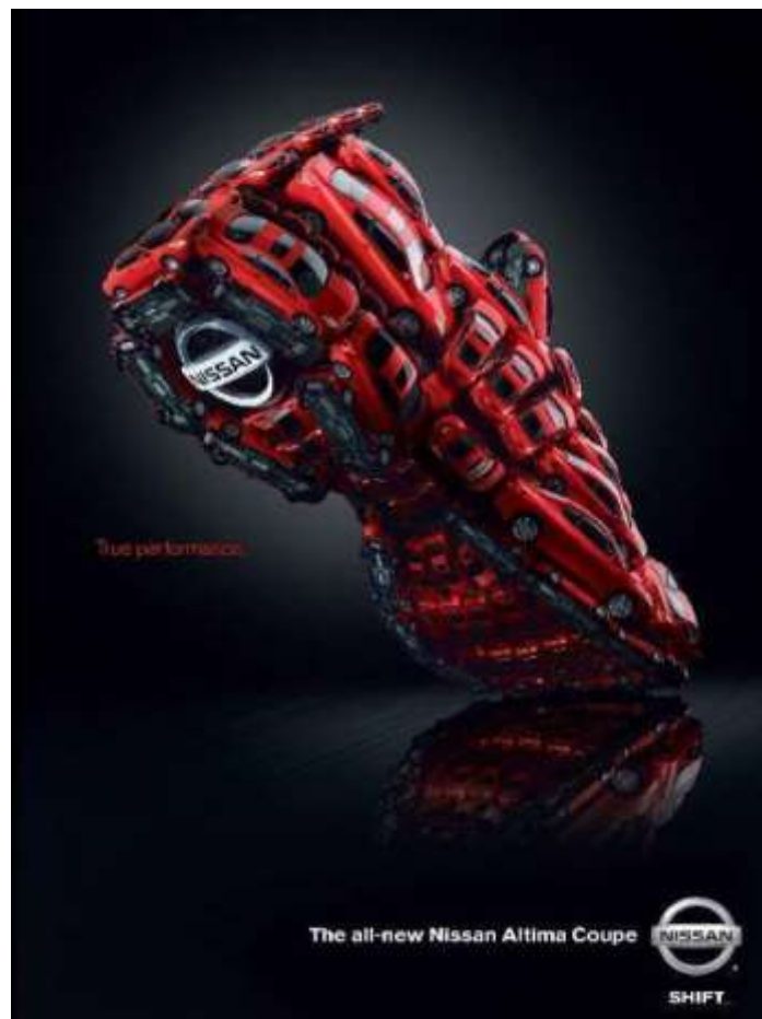
Figure 4. The creativity advertisement of Nissan (Freeport Press 2015)

continual barrage of materials. When a group of creatives collaborate to produce a campaign that artistically and successfully communicates the message of a business or organization, this is creative advertising (Reinartz & Saffert 2013). The purpose of creativity is to help brands to promote their products or services as well as create a following. A highly imaginative advertisement is likely to create an impression on consumers, according to Dahlén, Rosengren and Törn (2008). Customers perceive a brand as high-quality and noteworthy since they are impressed with its creative advertising. Nissan's advertisement is one example of creative advertising, as Figure 4 illustrates. The ad, which shapes Nissan's mini-version into the form of a running shoe, directly captures the fun and excitement of the audience with its stunning profile.