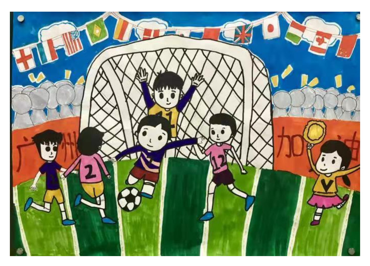
Figure 3: "painting activities" of football experimental school in Zhuhai district, Guangzhou