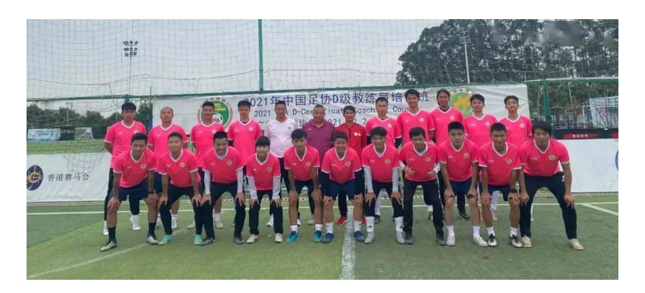
Figure 4: Class D coach training course of China Football Association