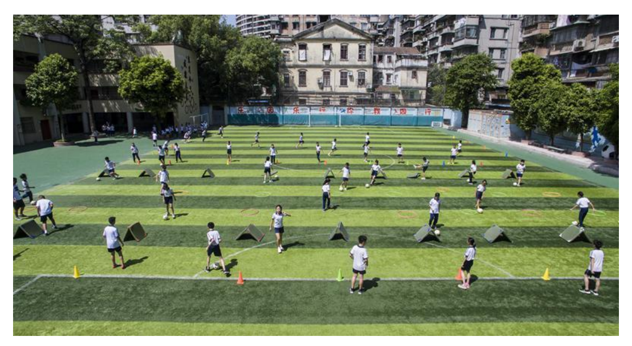
Figure 6: football game teaching activities