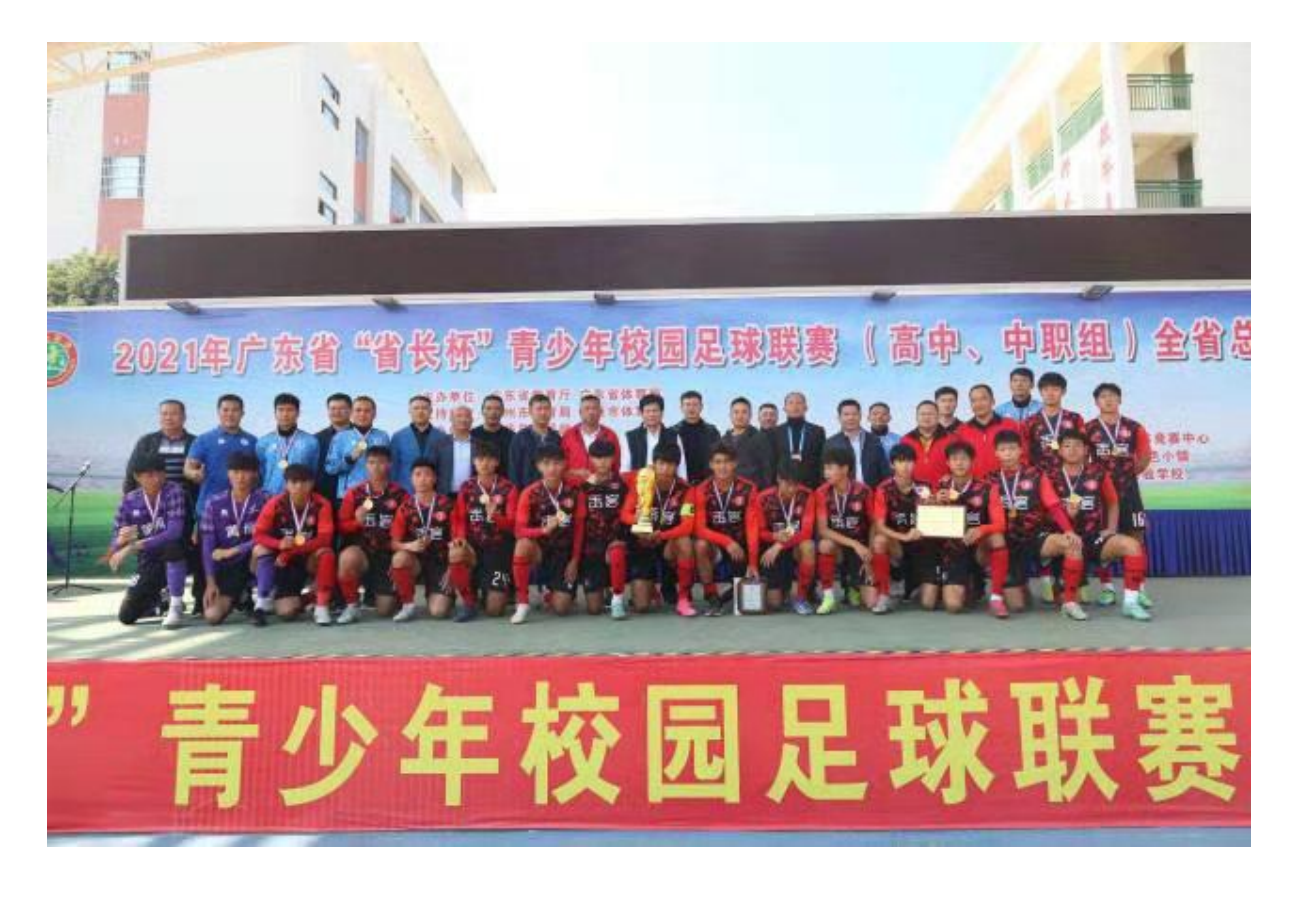
Figure 1: the final of Guangdong "governor's Cup" Youth Football League in 2021