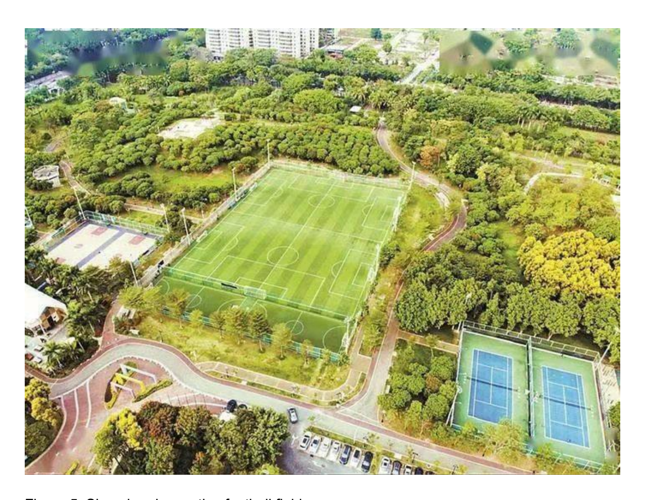
Figure 5: Shenzhen innovative football field