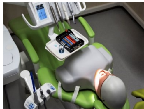
PICTURES 1–3. OUAS phantom devices from 1999 (left, picture: Meeri Oinonen), dental unit at campus Kontinkangas dental clinic in 2010 (picture: Meeri Oinonen) and modern phantom devices at real dental surroundings in Dentopolis (picture: OUAS).