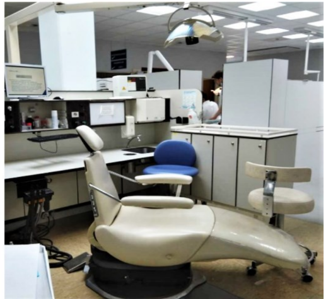
PICTURES 8–9. Dental clinic in Ghent in 2018 (pictures: Meeri Oinonen).

Our third-year internship takes place in private practice: one semester with general dentist and another with periodontist or orthodontist. You can choose the order, as long as it is 230 hours per semester. During this year we also visit elderly people's homes where we do checkups and treatment as well as give prevention instructions.