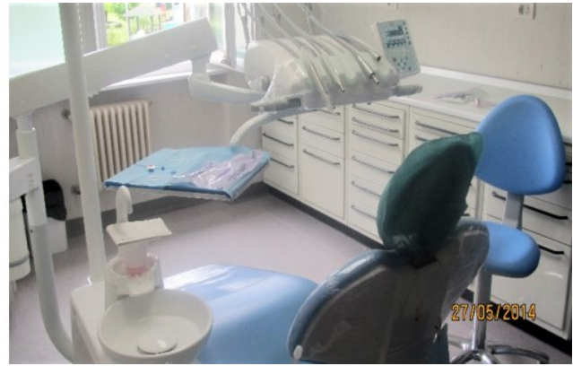
PICTURES 4–5. Phantom devices and a dental unit at the area of Rovereto in 2014.

In the third and final year the subjects of our studies are mainly peri-implantology, prosthetics and the administrative/legal management of our profession. This time our internship lasts for four months as we learn the use of manual instruments and deepen the techniques of working with ultrasound. At the end of the third year we are able to develop a treatment plan that meets patients' needs as well as manage their care in our area of responsibility. We graduate after completing our thesis.