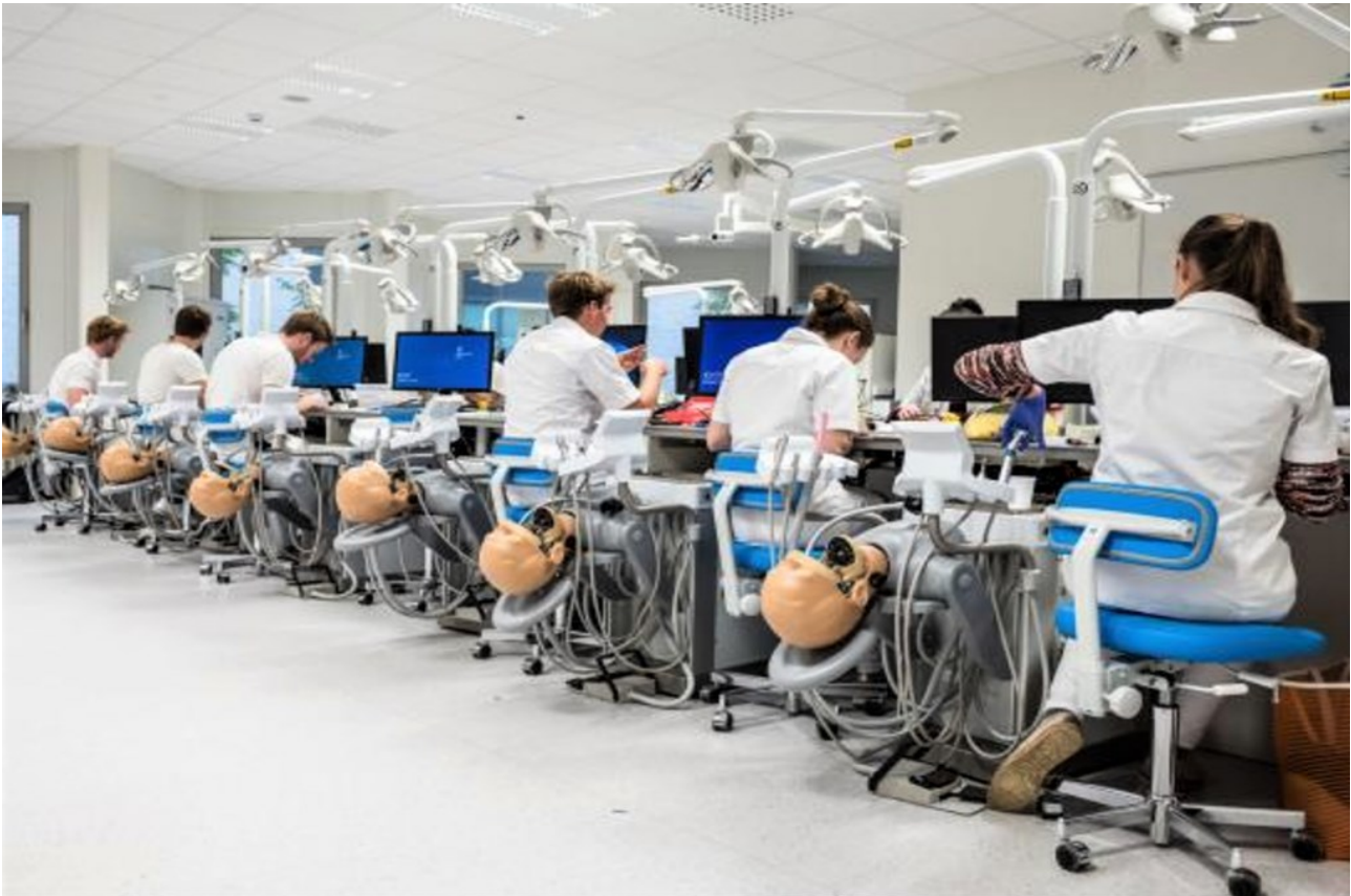
PICTURE 7. Practicing with phantom teeth in Ghent.

In the second year we start practicing with patients. Our internship is in the dental clinic (pictures 8–9), which looks like Dentopolis but older. During our internship in the dental clinic our tutors check every step of the process.