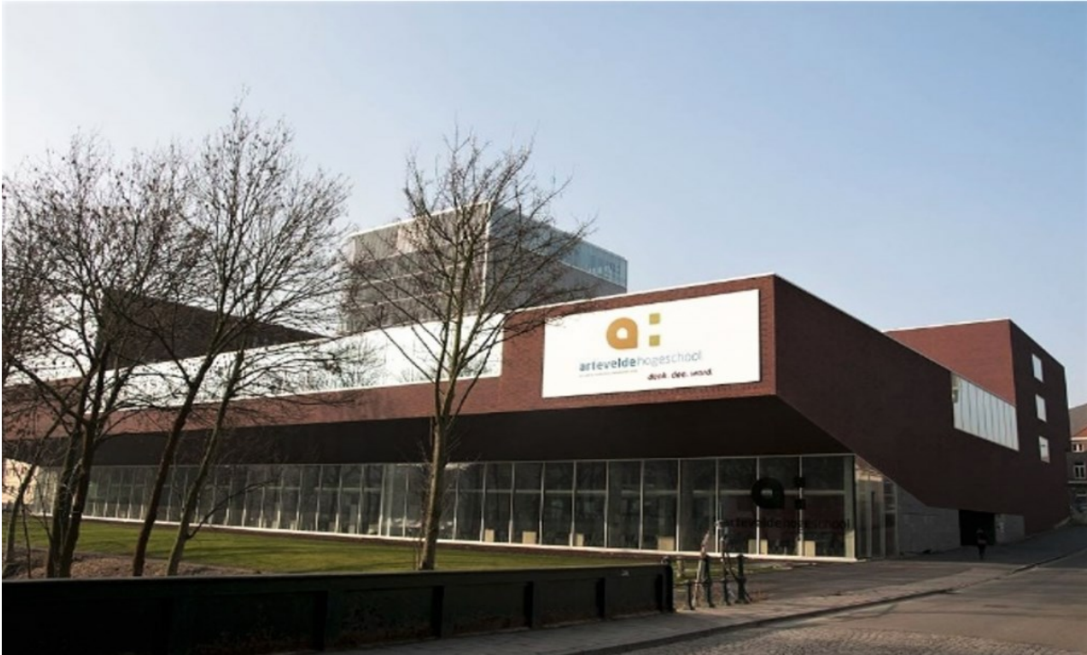
PICTURE 6. Main building of Artevelde Hogeschool in Ghent.

Our practical training starts in the first year with phantom teeth and manual instruments (picture 7). Unlike here in Oulu, we have separate facilities for laboratories and patient care. In the second semester we practice e.g. the rubberdam placement, use of the ultrasonic and the manual instruments with phantom teeth. During the first year we also have an observational internship of 20 hours in a private clinic.