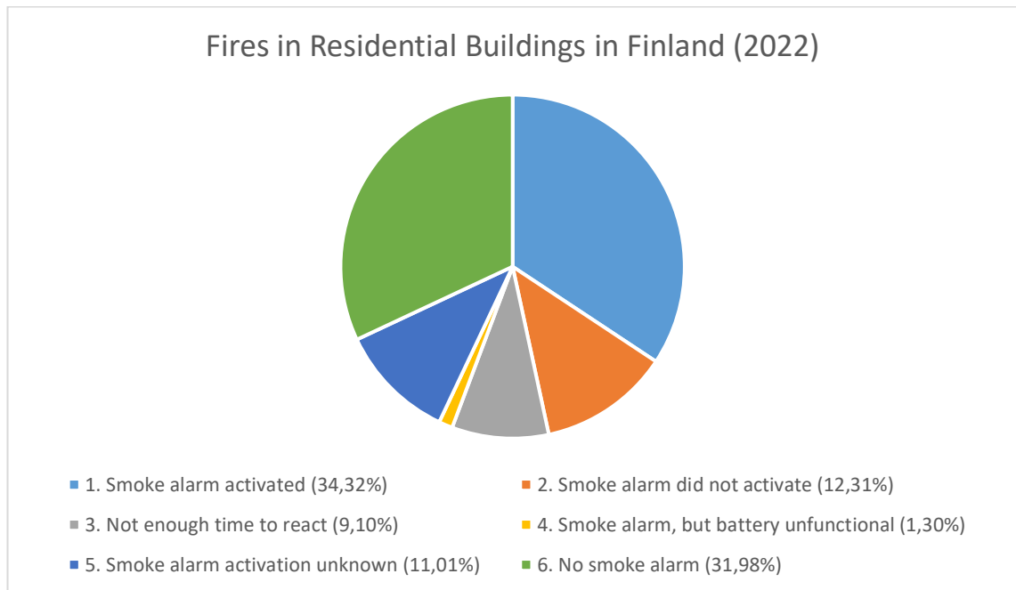
Figure 1: Statistics on the role of smoke detectors in fires in residential buildings in Finland in 2022 (Emergency Services Academy Finland, 2023)

Companies in the automotive industry are going through immense changes with the popularity of electric cars and vehicles growing considerably. According to the Finnish Transport and Communications Agency, in 2023 the number of electric cars registered in Finland was 29 536, an increase of 103% compared to the year 2022 (2024). The Finnish Central Organisation of Road Transport (2024) has generated a graph of the increase of usage of electric cars, which demonstrates the growth in the popularity. These changes affect many different aspects in the industry but for companies that maintain, sell, or possess such vehicles on their premises, the safety aspect of it is crucial. That would be a great reason for these companies to check their safety rules and regulations on their premises, including emergency plans. That was the case for this thesis even though the schedule of this project did not allow the research to go deeper into the subject and study how safety and security are present when dealing with the electric vehicles on the premises.