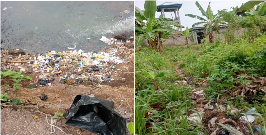
Figure 4: Open Dumping by the Stream