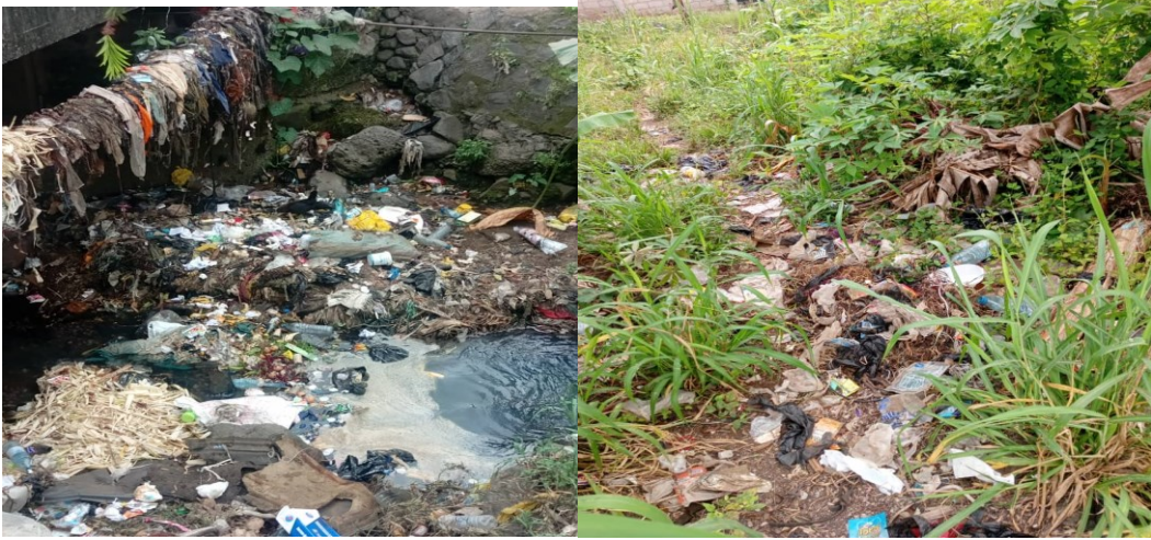
Figure 3: Indiscriminate Dumping of Waste