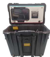
Fig.2 Picture NIR device

This is a process that requires multiple measurements and verification of the measurements, by comparison to laboratory results from the same samples. The fine-tuning was a lighter version, than a full re-calibration, but because of time limitations that was not an option.