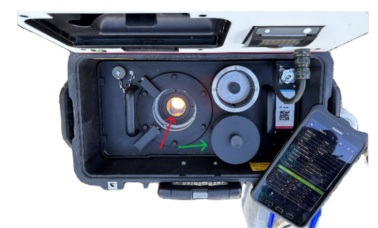
Fig.3 NIR device seen from above

See fig 3. The sample is placed into a cup (green arrow), which is positioned above the light source (red arrow). During the analysis, the cup rotates to ensure proper measurement. The entire system is operated and monitored using a tablet interface.