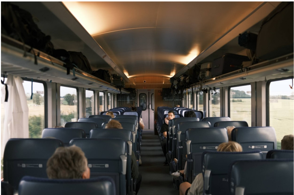
Interior of Danish train spacious and stylish.