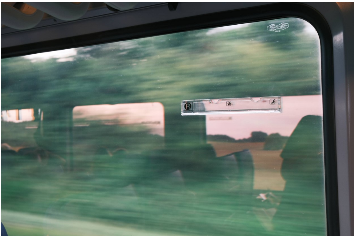
We managed to catch up!