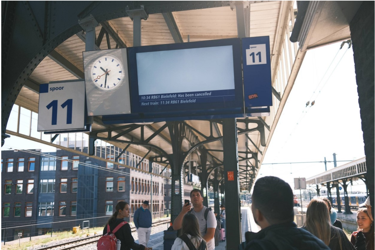
Our first DB train got canceled.