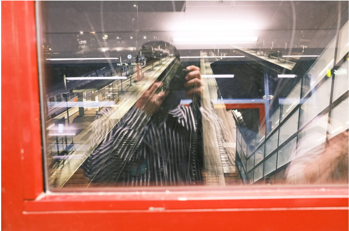
Midnight train change somewhere in Sweden.