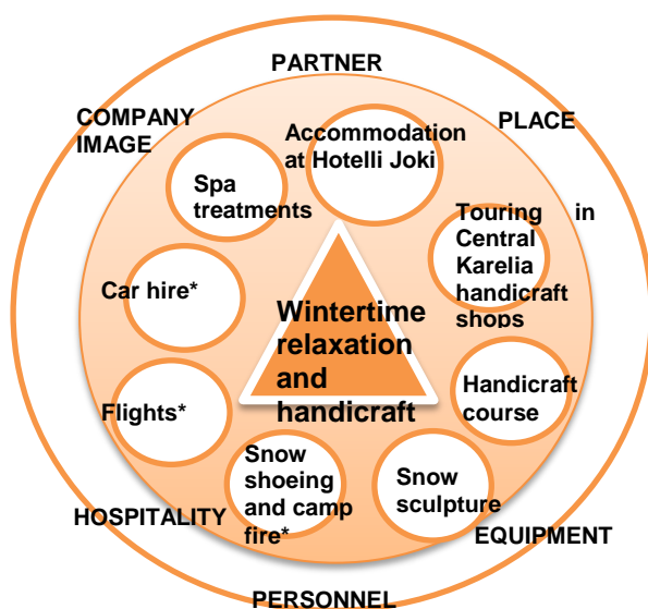
Figure 3. Wintertime handicraft tour

The package combines handicrafts, relaxation and winter. The idea is to provide guests a unique experience in the remote area of Central Karelia in a crispy winter atmosphere. The holiday offers the opportunity to tour at the art galleries and handicraft shops and participate in a handicraft course with professional guidance. The guests can prepare snow sculptures and express their creativity playfully. The guests are provided as a counterbalance relaxation in sauna, enjoy massage or beauty treatments and a visit to a salt chamber.