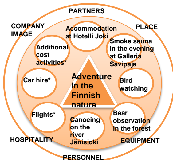
Figure 2. Fall and spring animal observation tour package