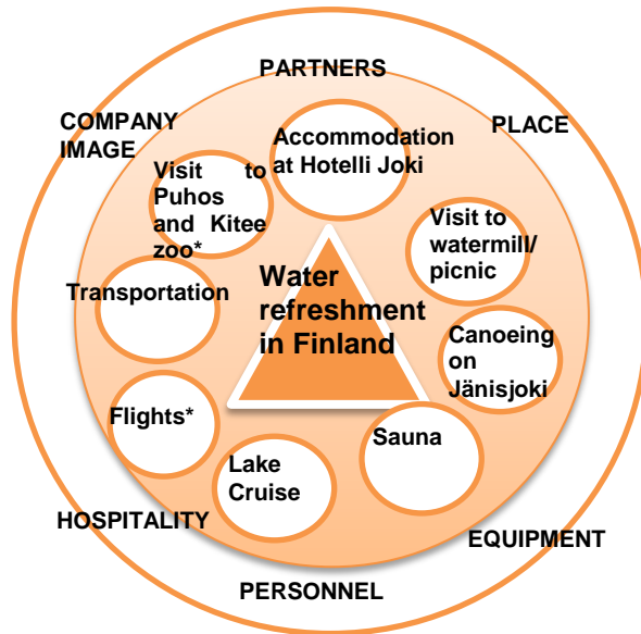
Figure 4. Summertime water theme holiday

This water themed holiday gives a fresh break for those who long after a cooling escape from the blazing summer sun. The weather in Finland in the summer can be unpredictable but one thing is certain, there is plenty of water around, and lightness.