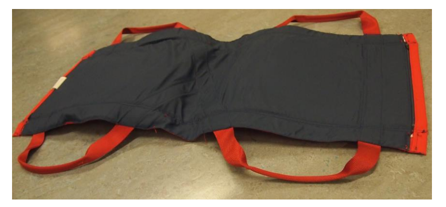
Picture 5. Assistive device designed to help two people assisting. (Janette Ahola, 2015)

Assistive aids which reduce friction are commonly used in health care. A plastic bag or silk sheet are the simplest materials which are used in this purpose. When there is a need for friction, for example when assisting to stand up and the client needs some extra friction under his footing, assistive aids to increase friction are used. These aids prevent the client from sliding down when pushing himself up from the bed for example. Material for this kind of aids can be for example rubber or plastic. (Eloranta, Kivivirta, Mämmelä, Salokoski, Tamminen-Peter, Ylikangas, 2007, 45) If the client who needs assistance is out of proper reach or normal hold is not sufficient enough, the assisting person should use assistive aids to improve his grip instead of pulling from the clothes or lifting under the armpits (Picture 6). (Eloranta, Kivivirta, Mämmelä, Salokoski, Tamminen-Peter, Ylikangas, 2007, 44)