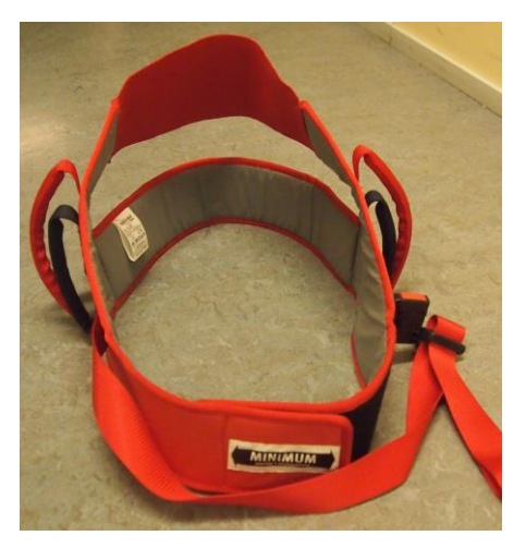
Picture 5. Assistive device designed to improve grip. (Janette Ahola, 2015)

Assistive aids which reduce friction are commonly used in health care. A plastic bag or silk sheet are the simplest materials which are used in this purpose. When there is a need for friction, for example when assisting to stand up and the client needs some extra friction under his footing, assistive aids to increase friction are used. These aids prevent the client from sliding down when pushing himself up from the bed for example. Material for this kind of aids can be for example rubber or plastic. (Eloranta, Kivivirta, Mämmelä, Salokoski, Tamminen-Peter, Ylikangas, 2007, 45) If the client who needs assistance is out of proper reach or normal hold is not sufficient enough, the assisting person should use assistive aids to improve his grip instead of pulling from the clothes or lifting under the armpits (Picture 6). (Eloranta, Kivivirta, Mämmelä, Salokoski, Tamminen-Peter, Ylikangas, 2007, 44)